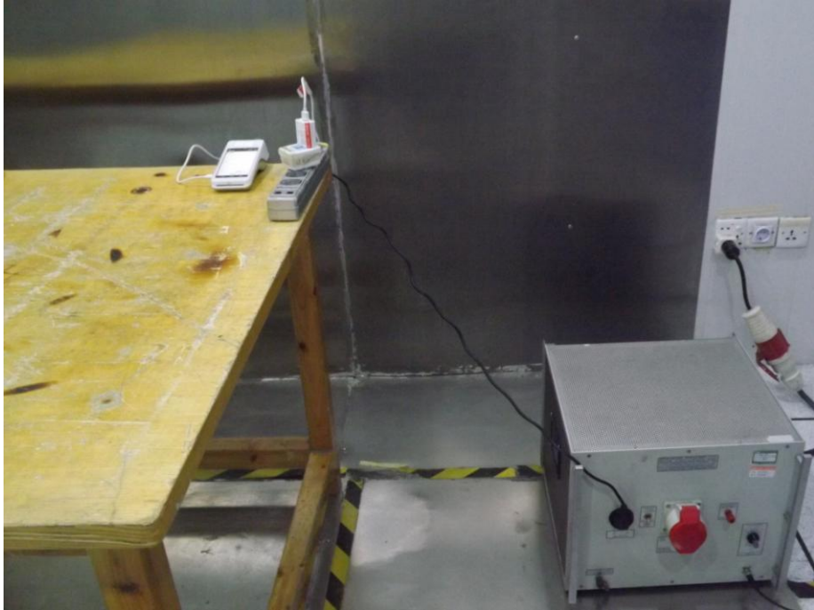
Test Site 1#