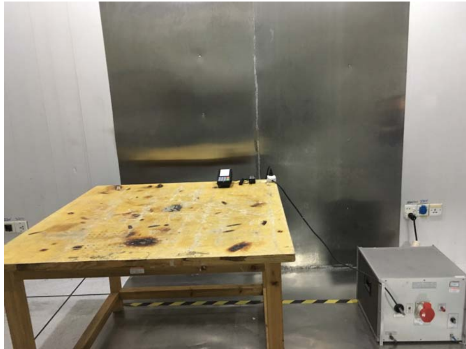
Test Site 1#