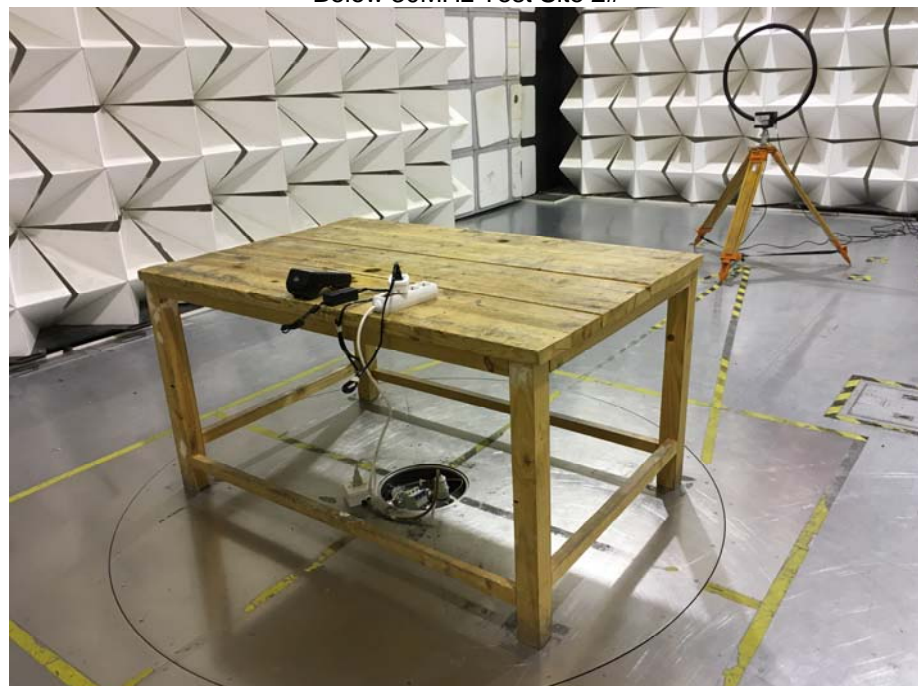
Below 30MHz Test Site 2#