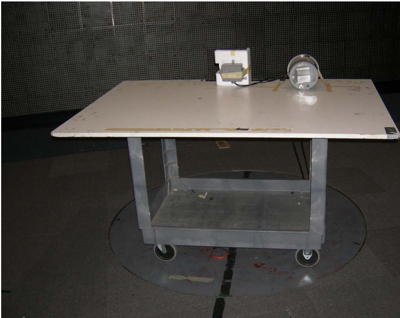
Figure 4: Test Setup Radiated Emissions – Unintentional