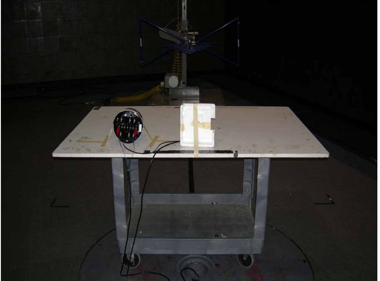
Figure 3: Test Setup Radiated Emissions – Unintentional