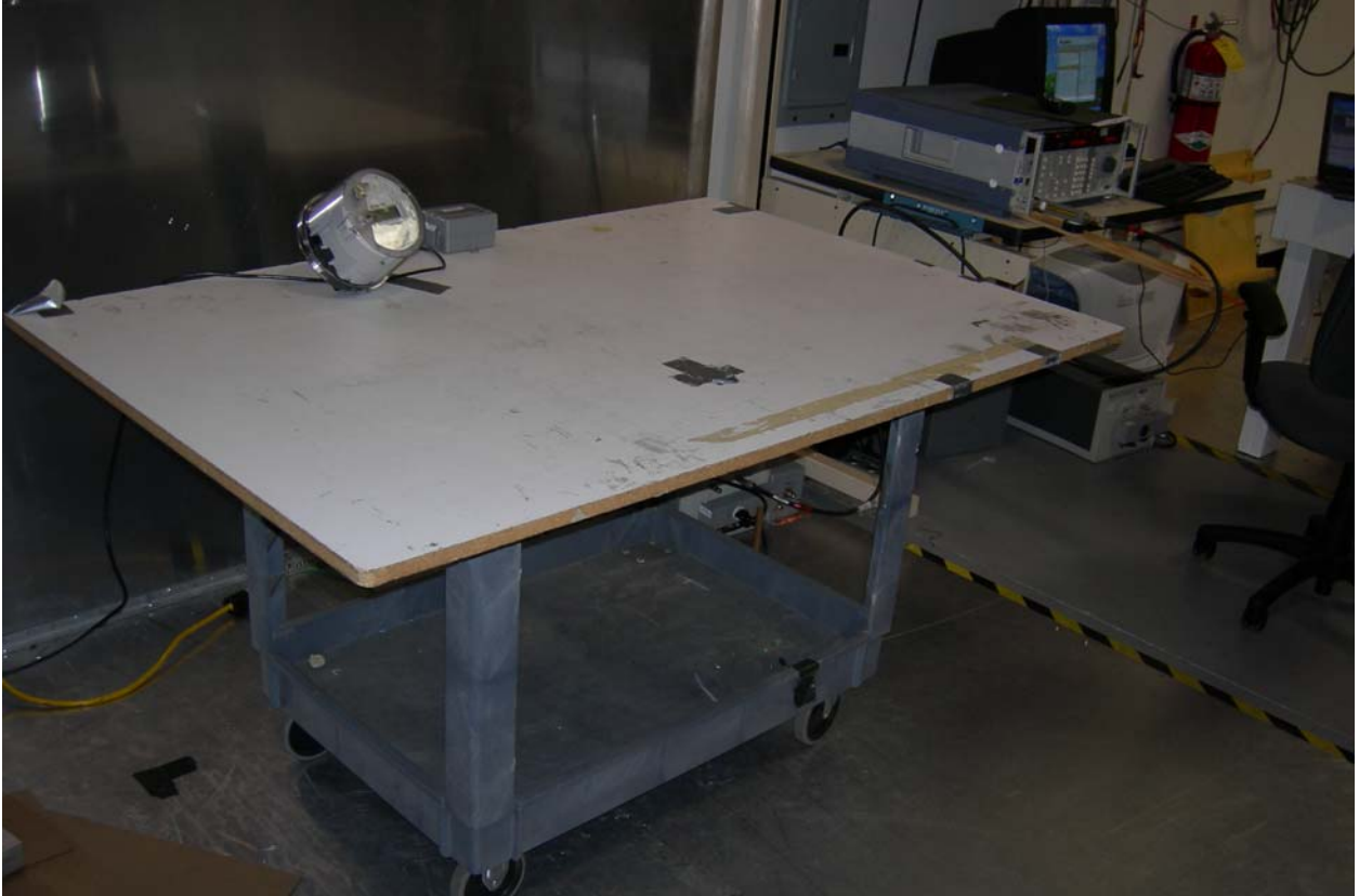
Figure 2: Test Setup Photographs– AC Power Line Conducted Emissions