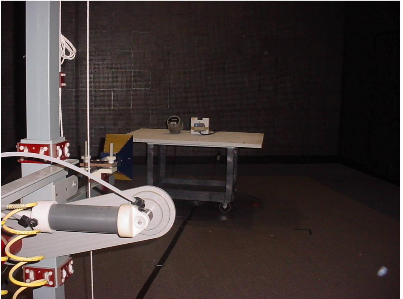
Figure 6: Test Setup Radiated Emissions - Intentional