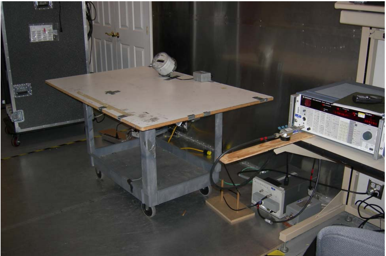
Figure 1: Test Setup Photographs – AC Power Line Conducted Emissions