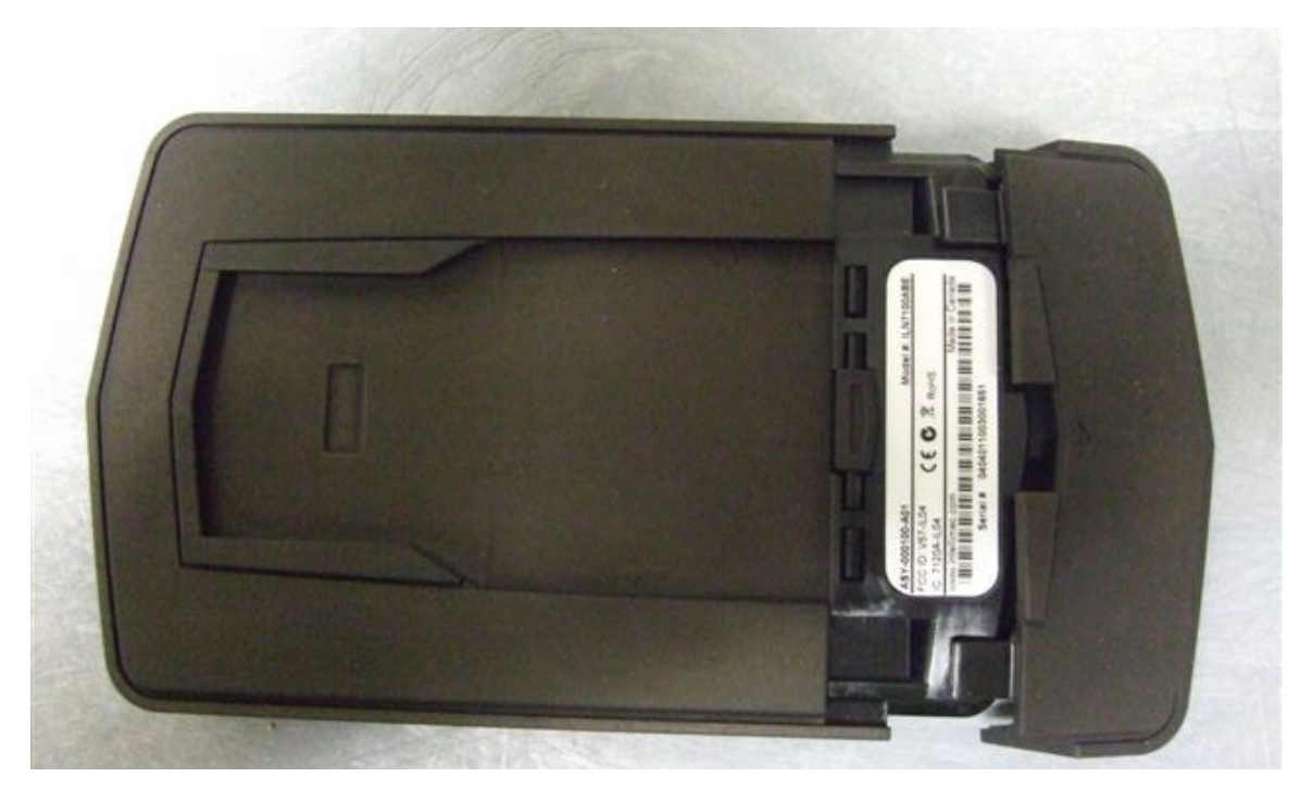
Fig. 4 iLane bottom cover completely removed, label exposed.