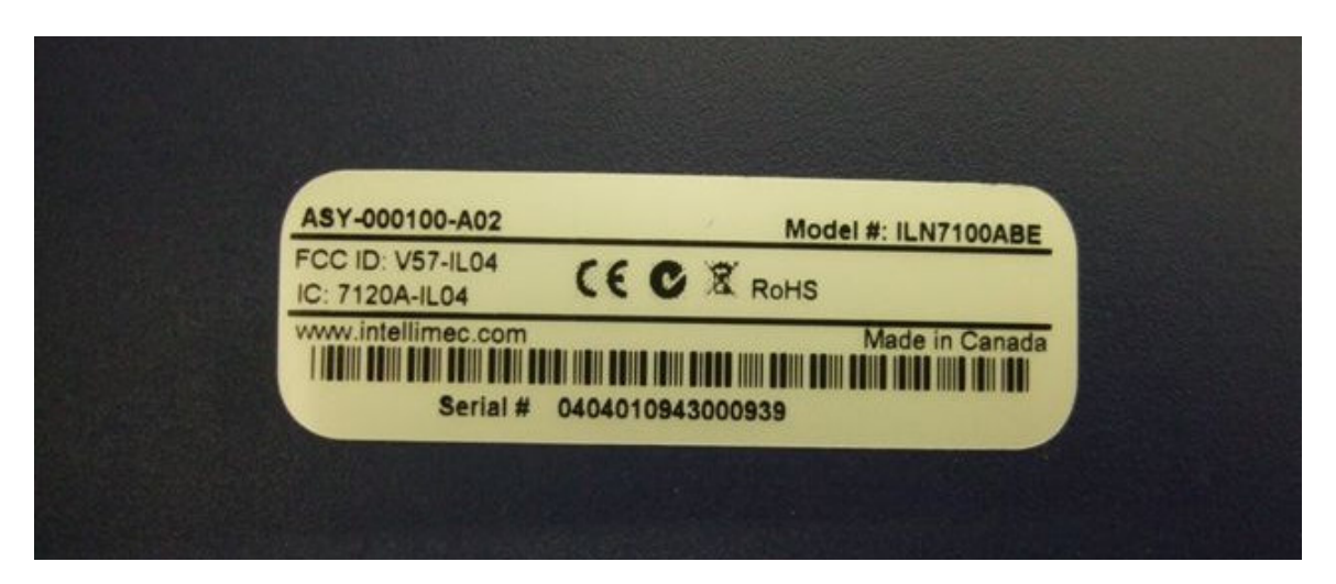
Fig. 1 iLane Label