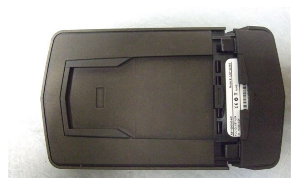
Fig. 3 iLane bottom cover being removed to access the connectors and label.