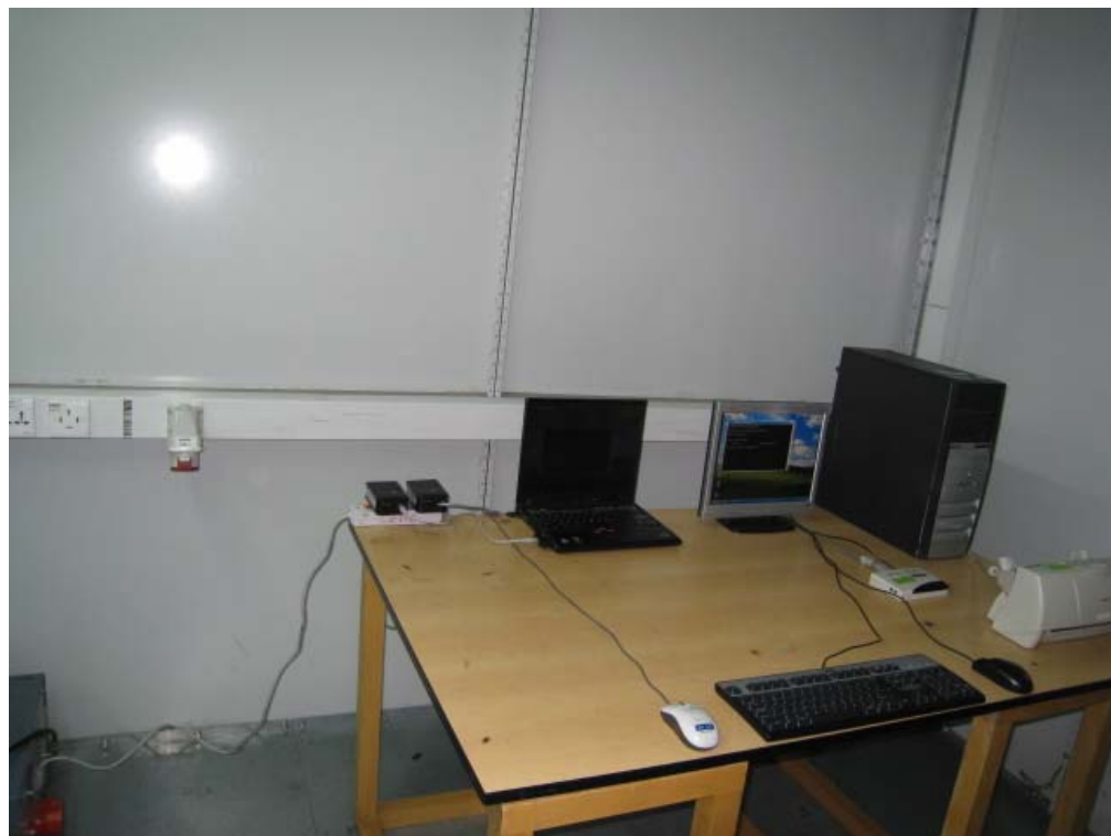
Photograph 2: Set-up for Conducted Emission Measurement