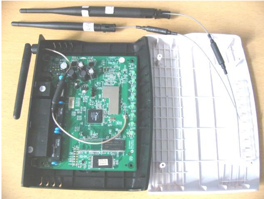
Main & RF board component side