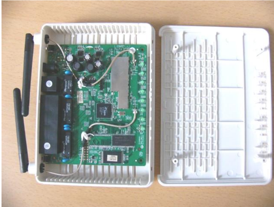
Main & RF board component side