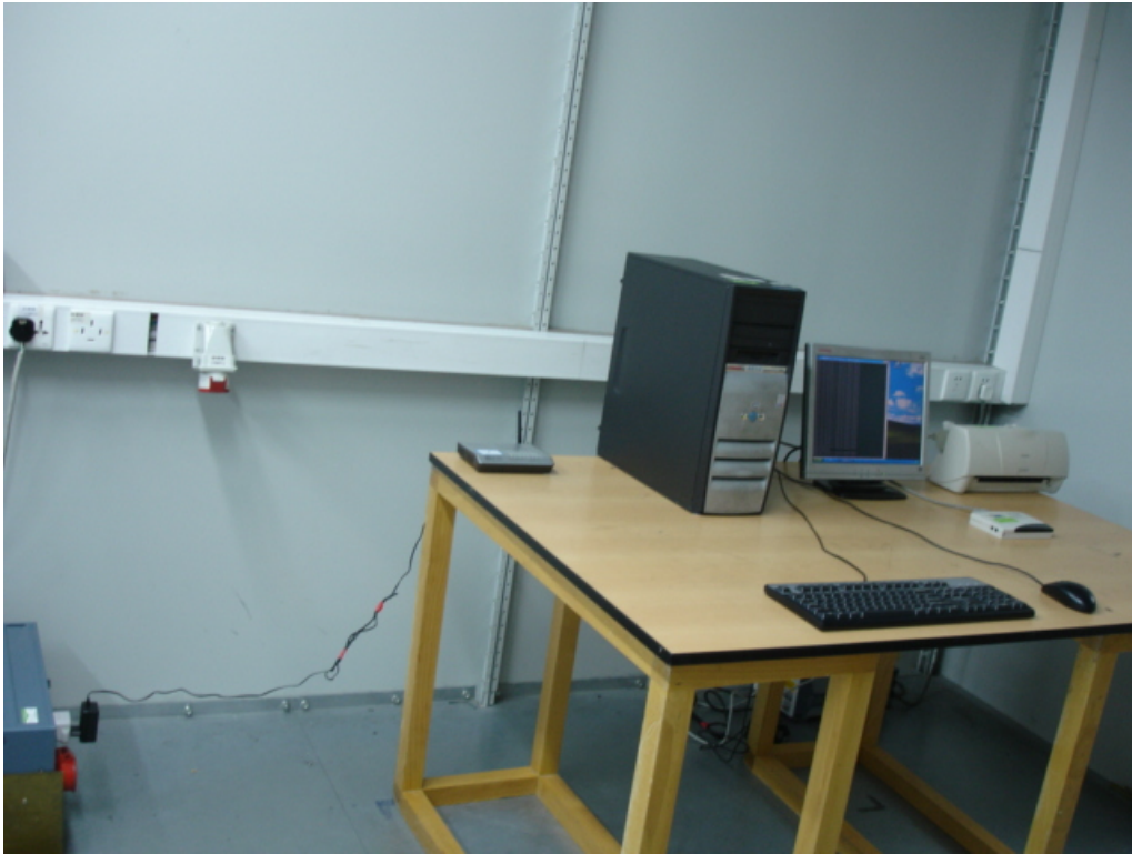
Photo 2 Conducted Emission Test