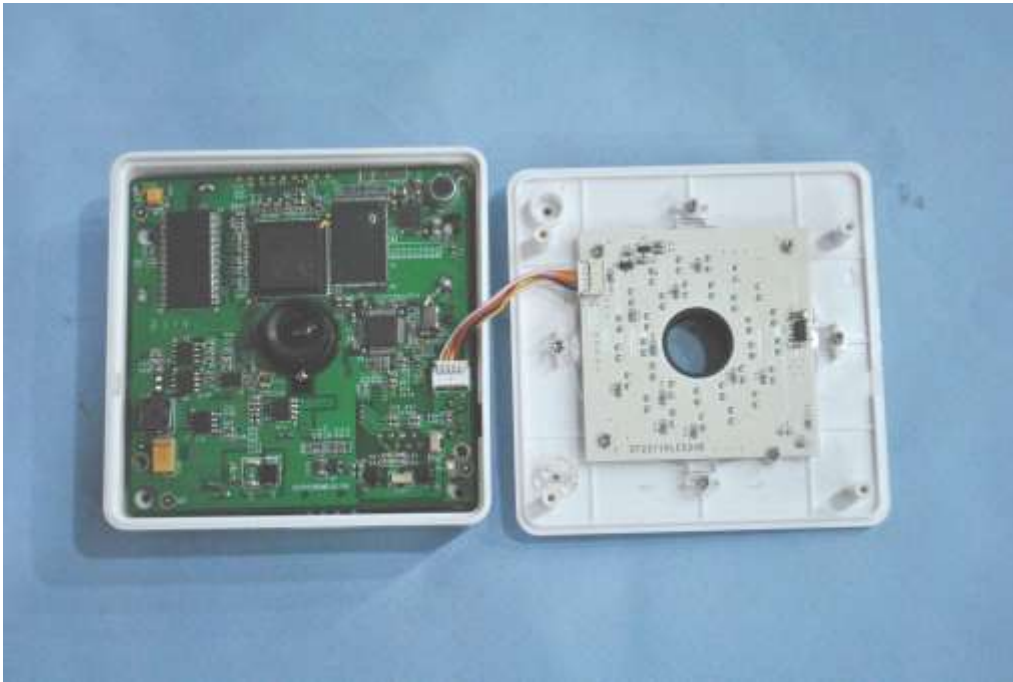
Main & RF board component side