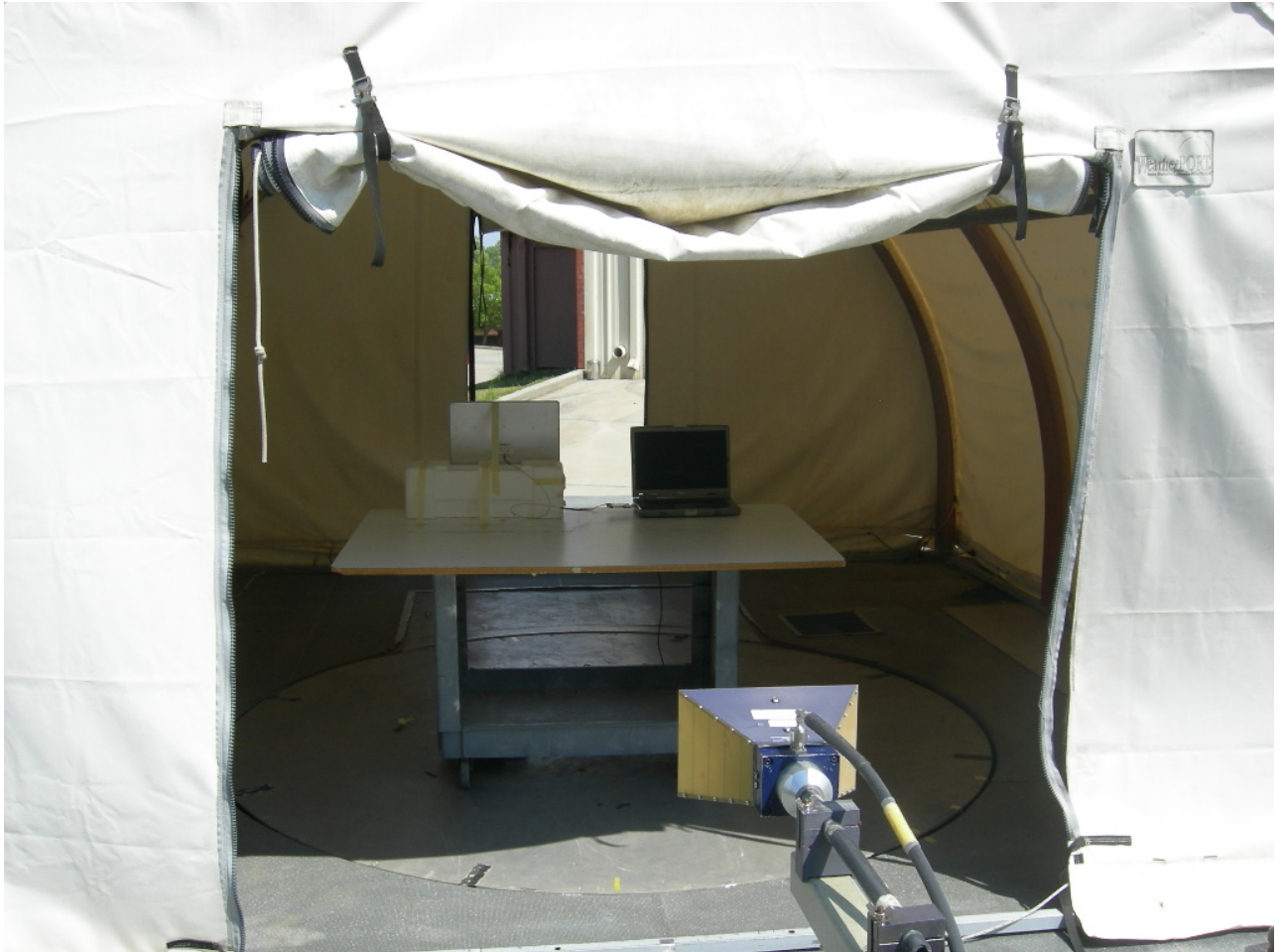
Figure 8: Radiated Emissions – Panel Antenna