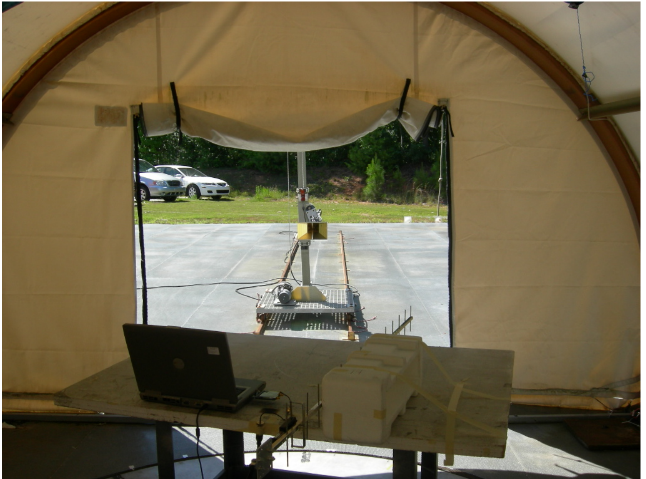
Figure 5: Radiated Emissions – Yagi Antenna