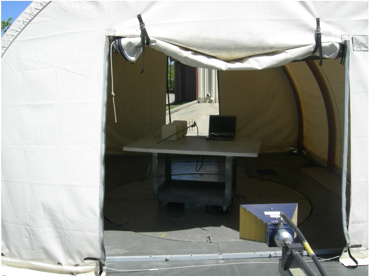
Figure 6: Radiated Emissions – Yagi Antenna