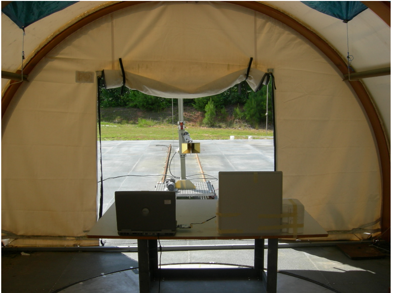
Figure 7: Radiated Emissions – Panel Antenna