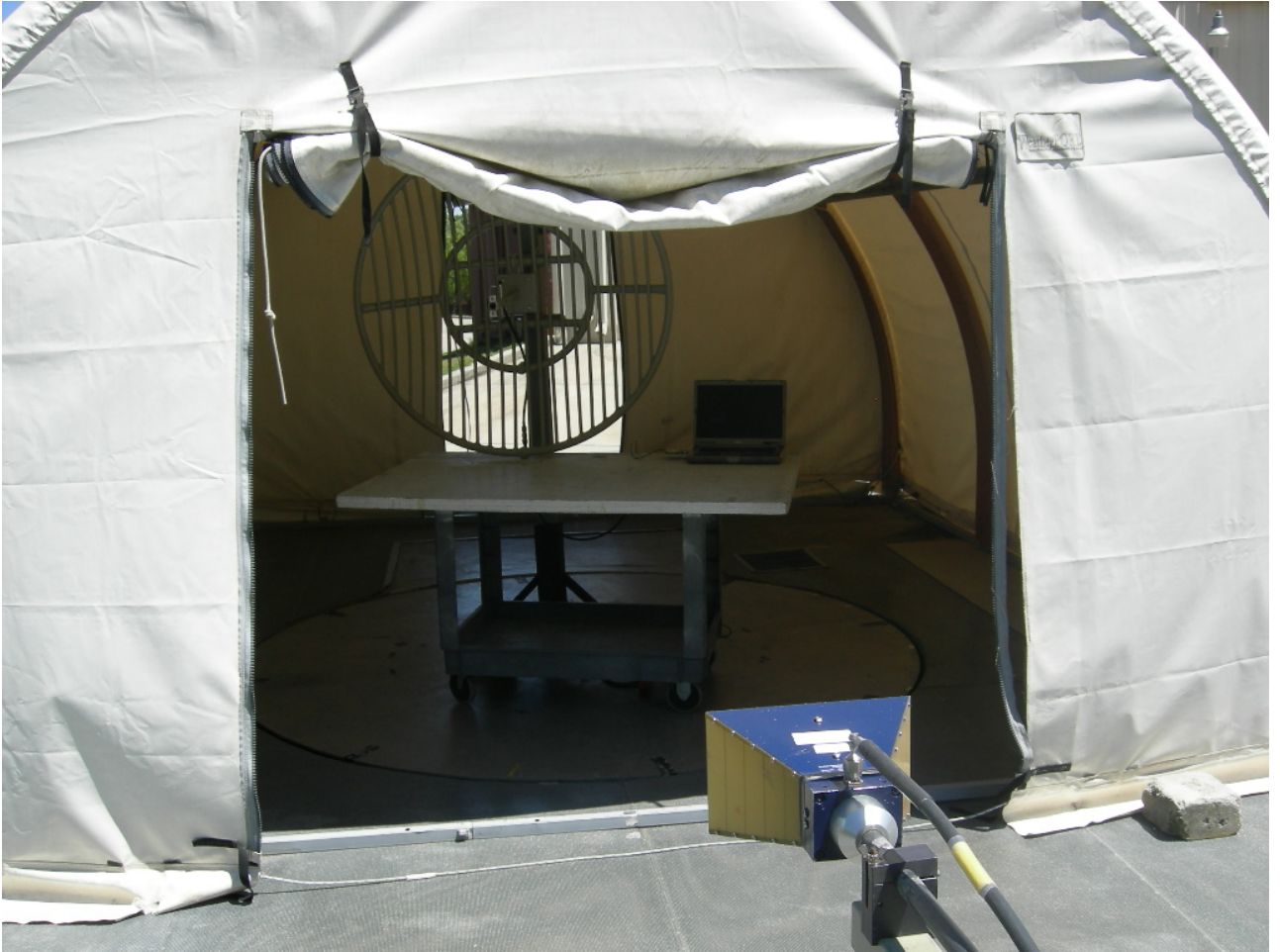
Figure 4: Radiated Emissions – Grid Antenna