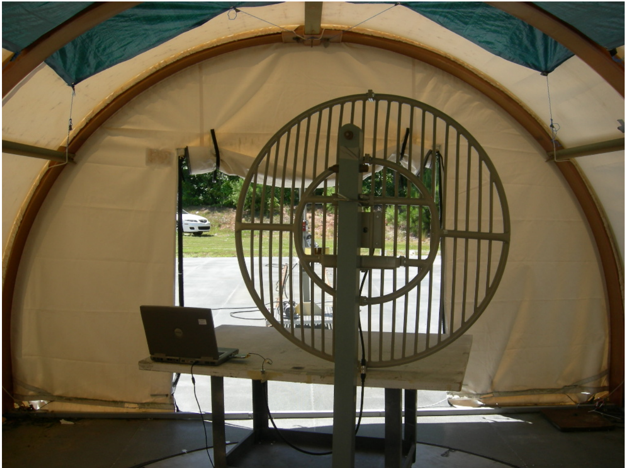
Figure 3: Radiated Emissions – Grid Antenna