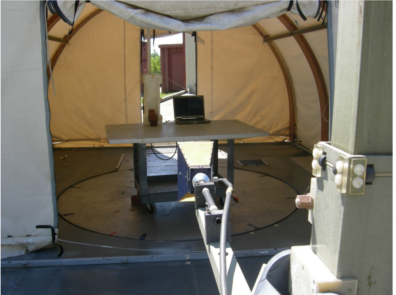
Figure 2: Radiated Emissions – Omni Antenna