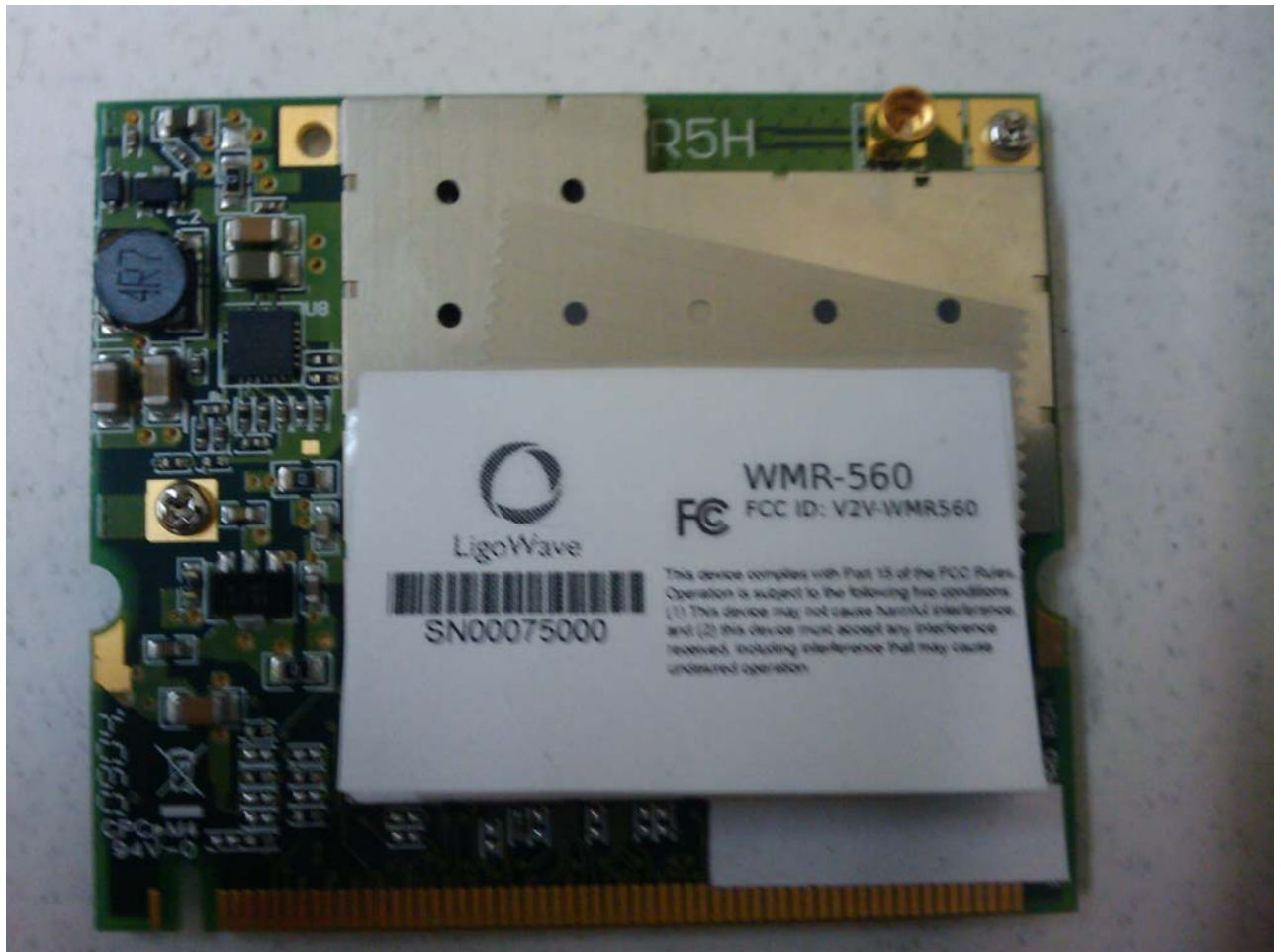
Figure 2: Label Location