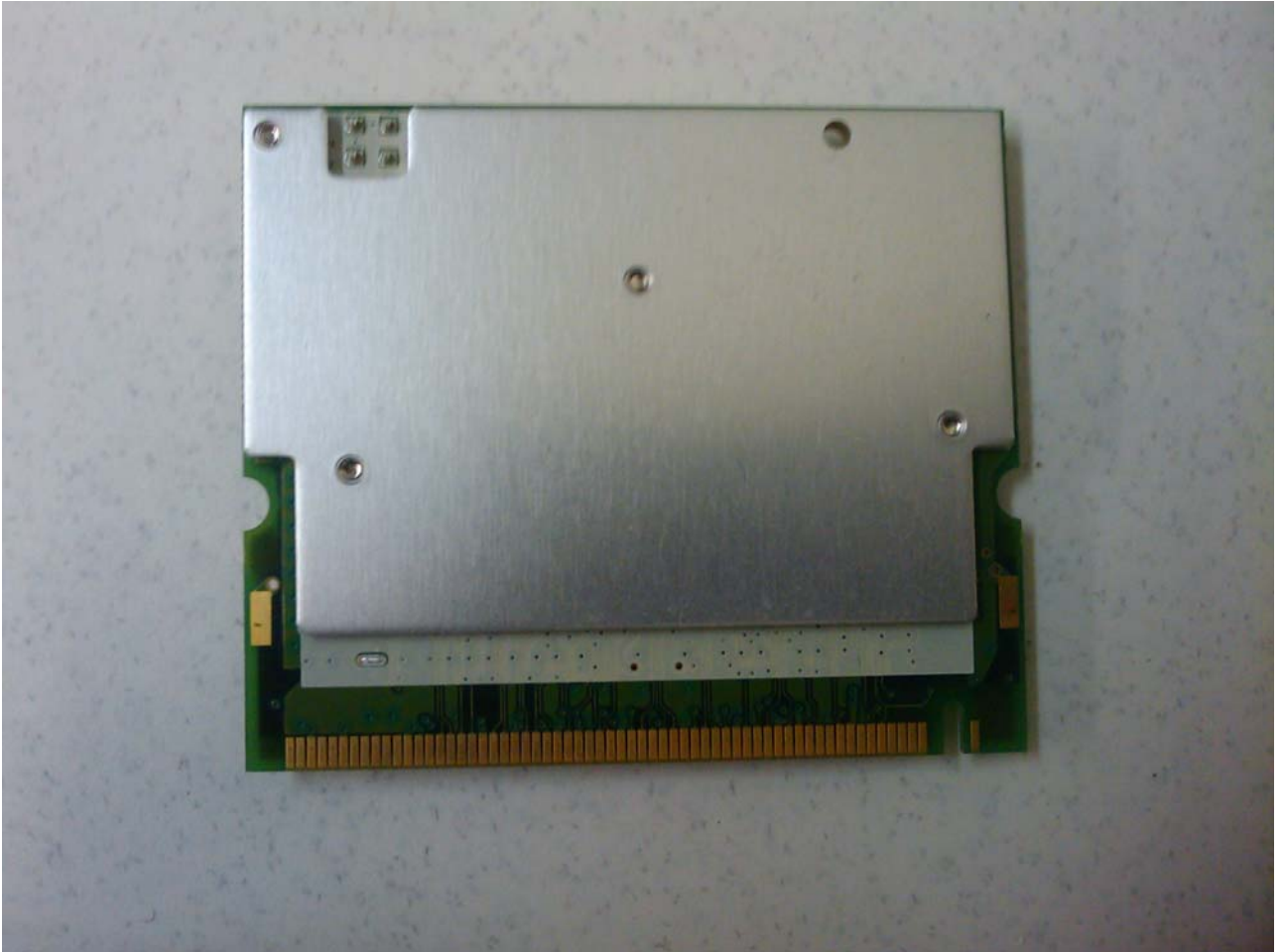
Figure 3: PCB - Back