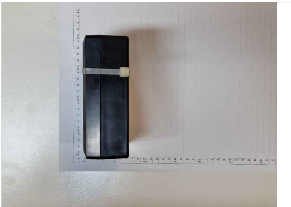
Photograph 4: EUT 1_Side view