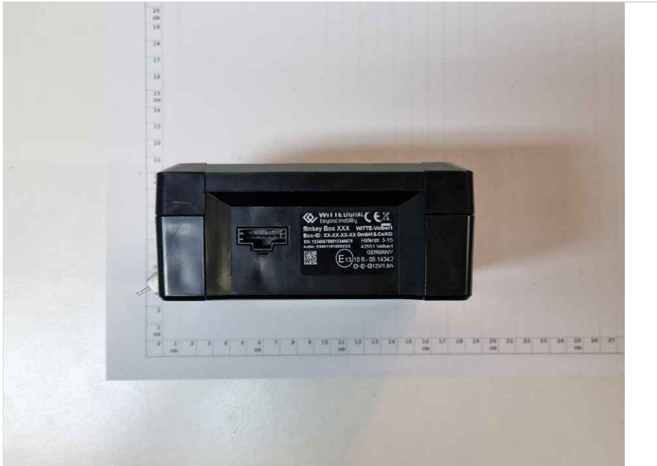
Photograph 5: EUT 1_connector and label side view