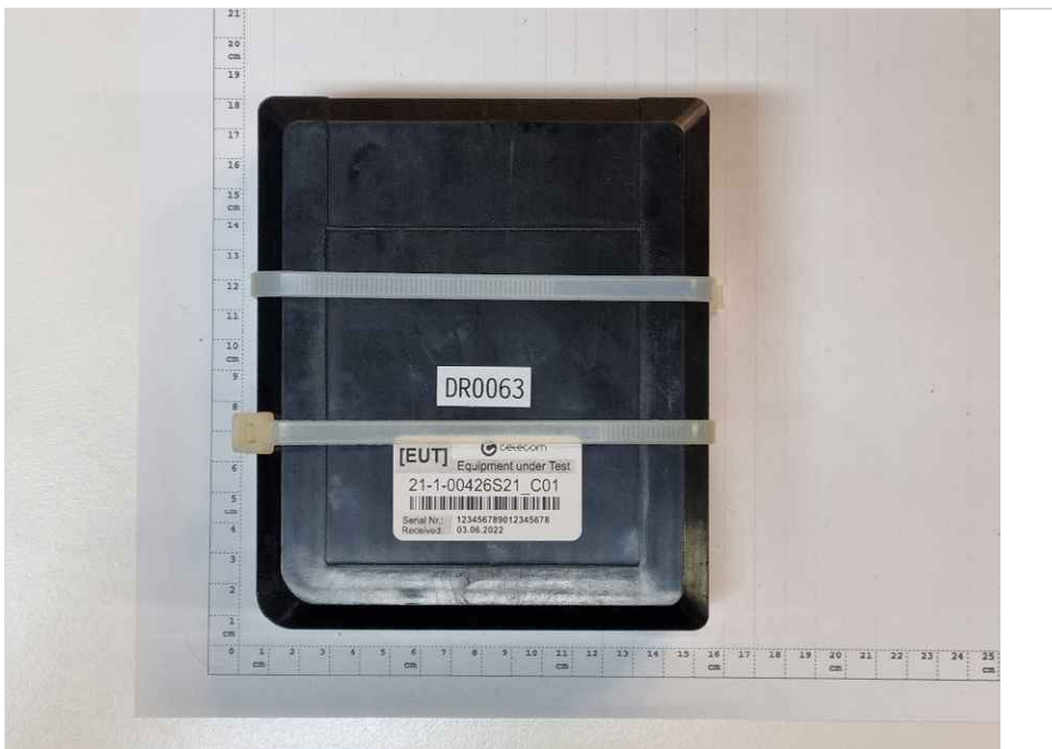
Photograph 6: EUT 2_Top side view