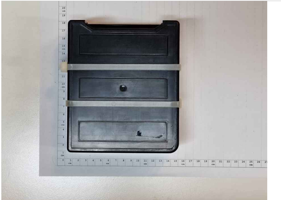
Photograph 7: EUT 2_Under side view