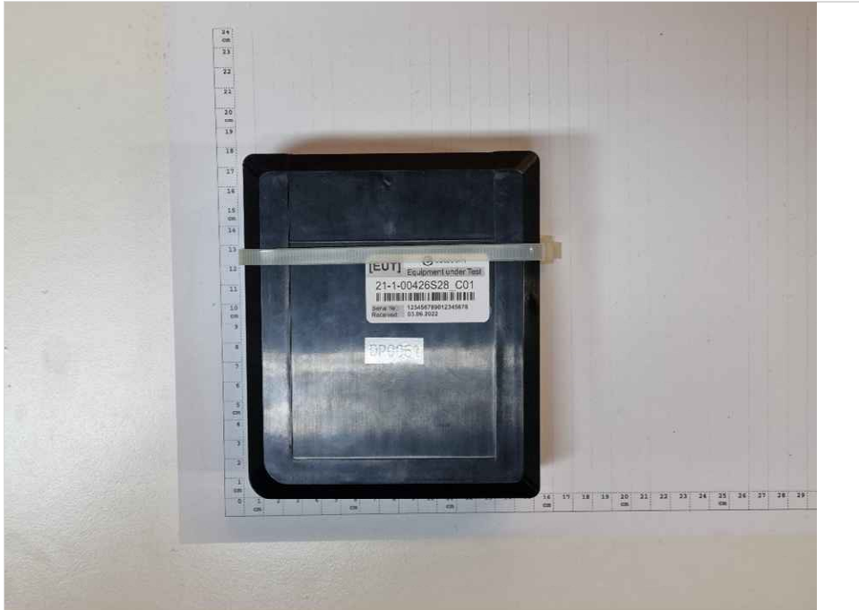
Photograph 1: EUT 1_Top side view