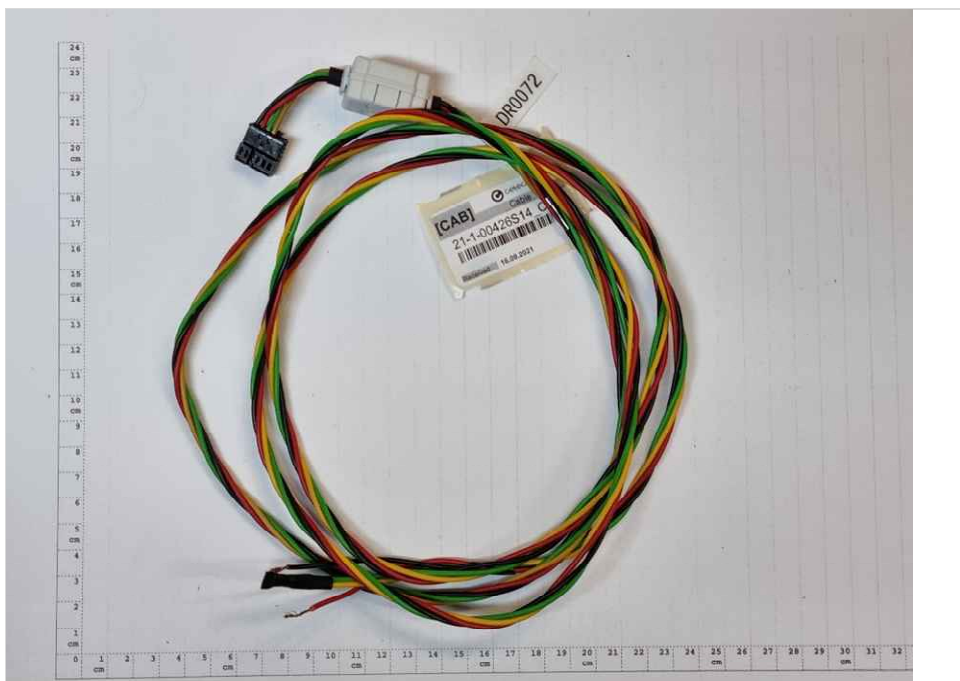
Photograph 2: CAB 1_CAN / Power cable