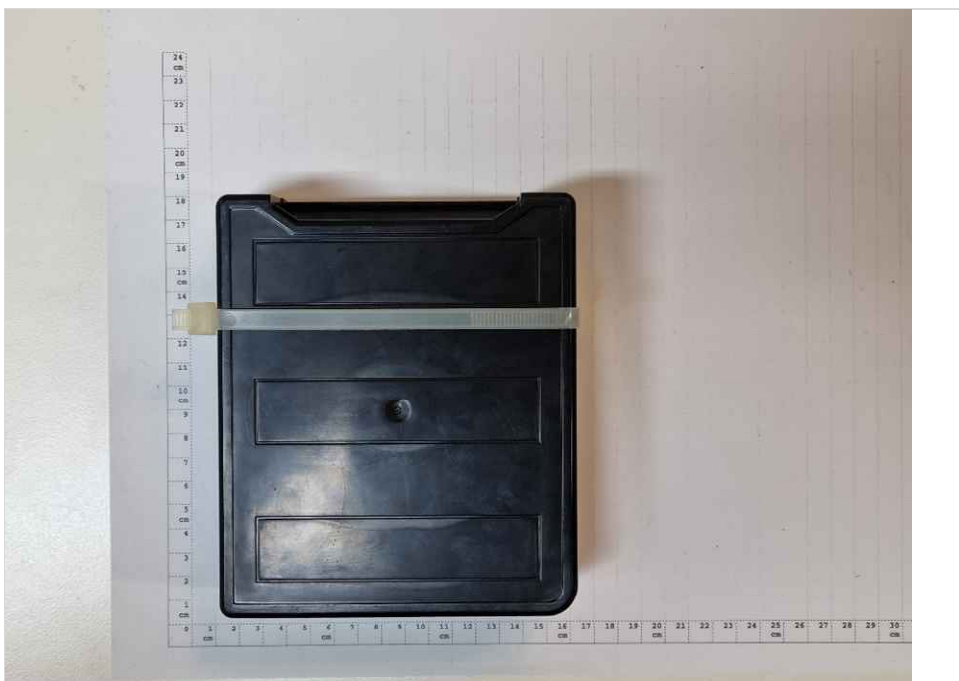
Photograph 2: EUT 1_Under side view