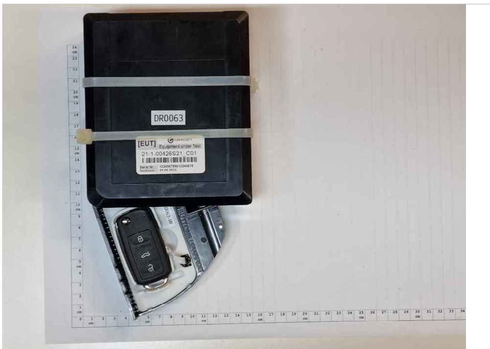
Photograph 8: EUT_Key fob placement