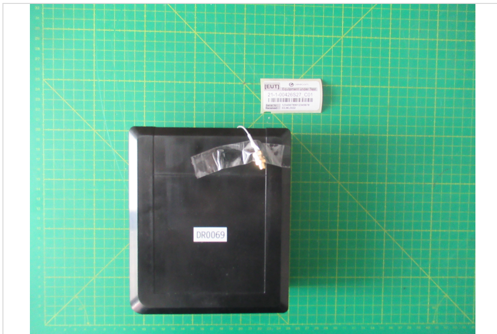
Photograph 1: EUT 01