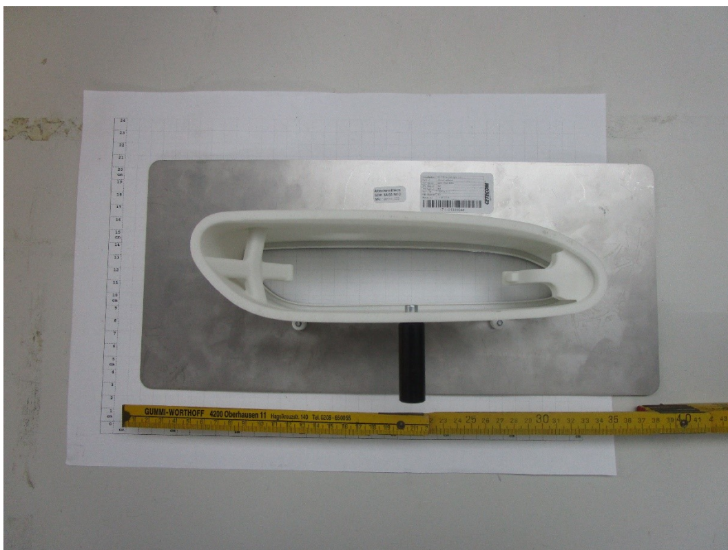
Photograph 4: AE 1