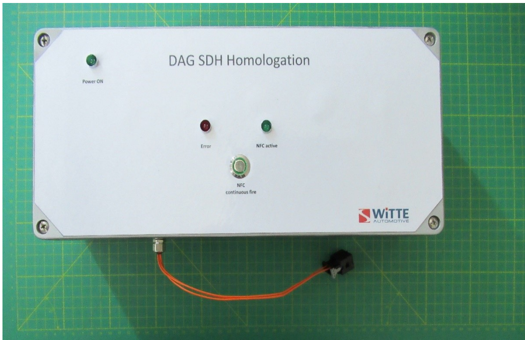
Photograph 3: AE 2