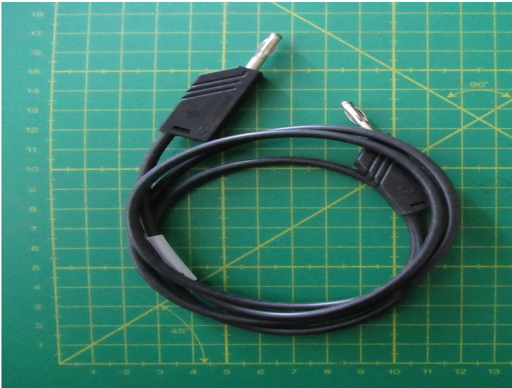
Photograph 7: AE 3