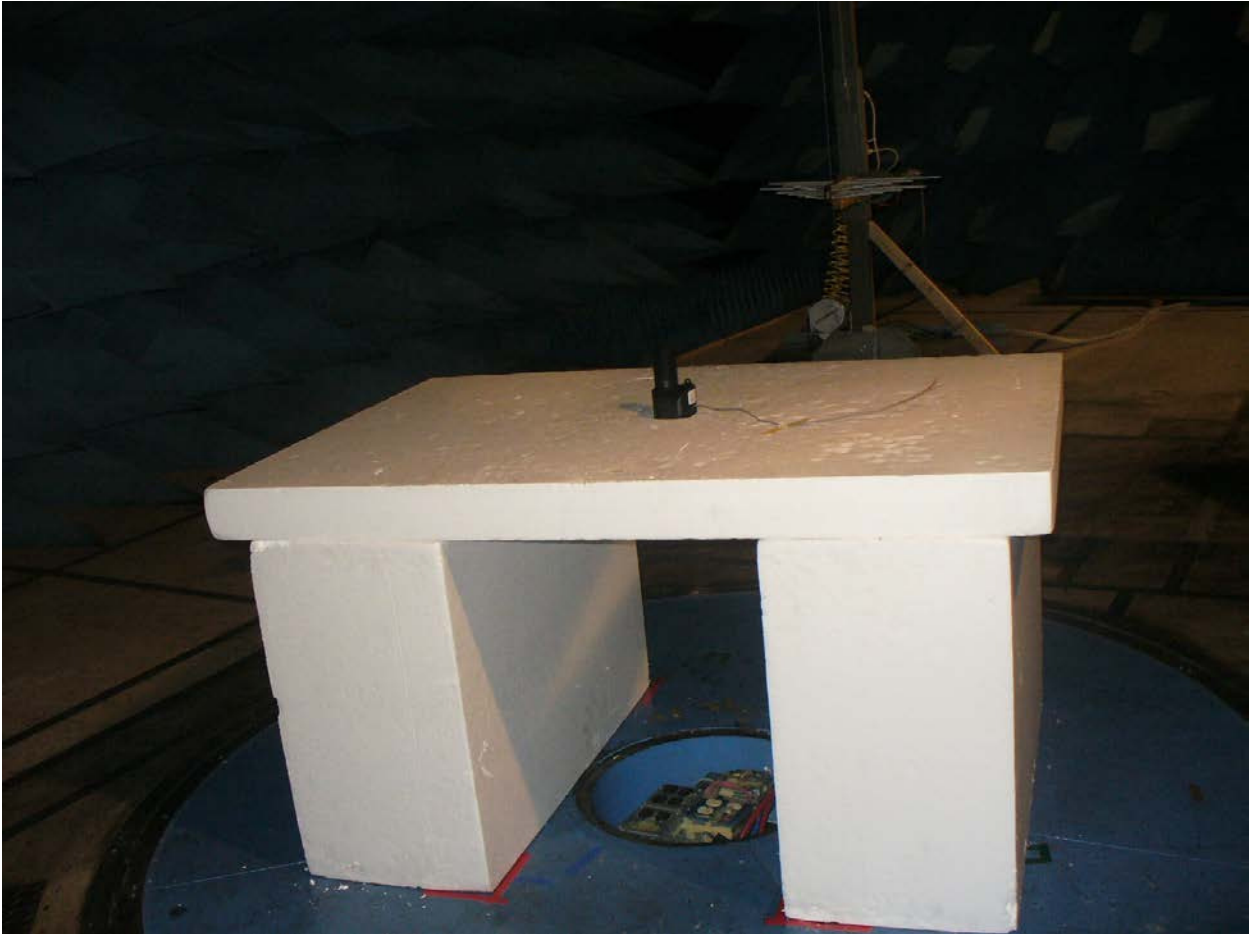
Figure 4: Radiated Emissions – Back View – 200 MHz – 1 GHz