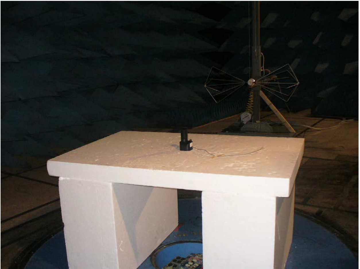
Figure 3: Radiated Emissions – Back View – 30 MHz – 200 MHz