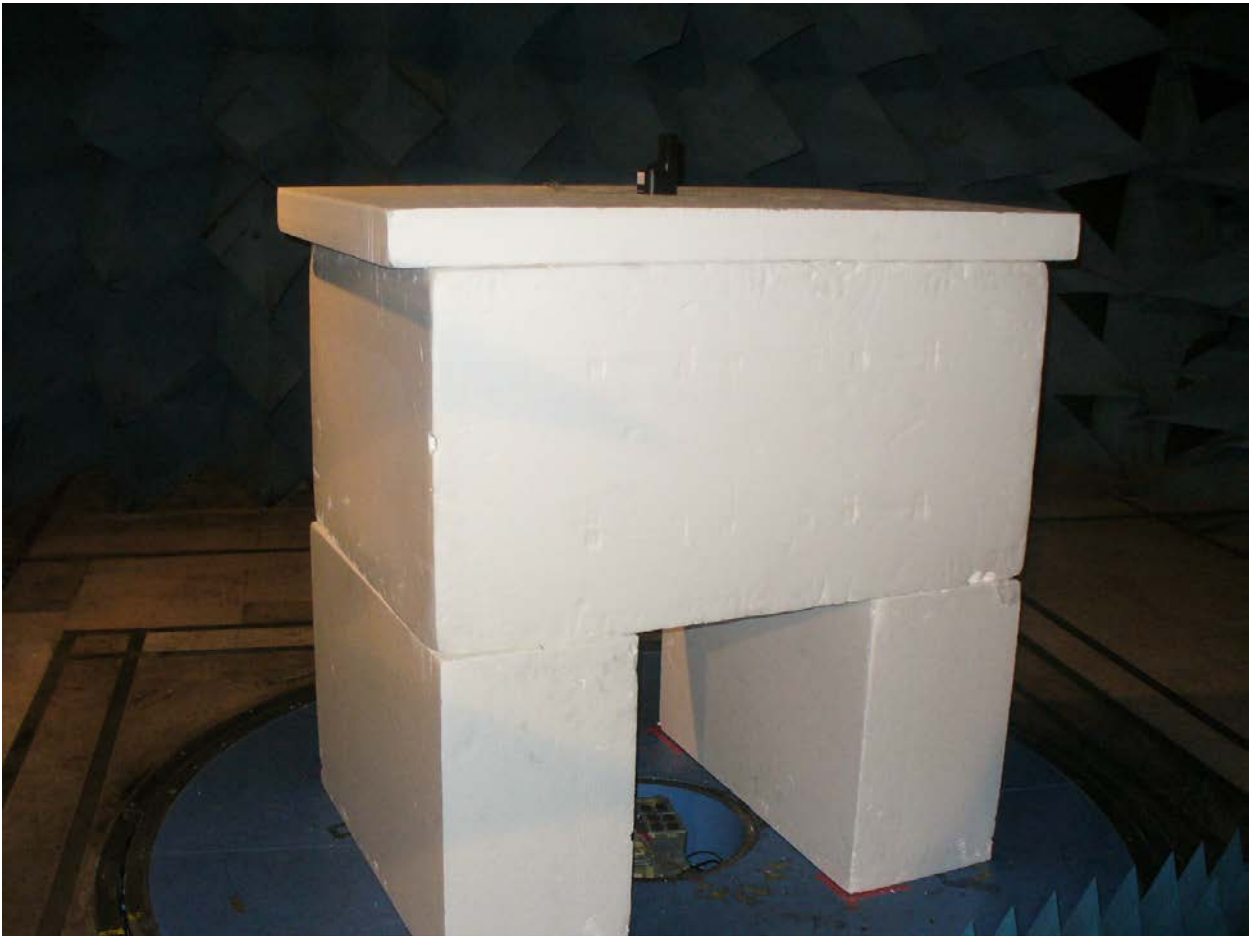
Figure 5: Radiated Emissions – Front View – Above 1 GHz