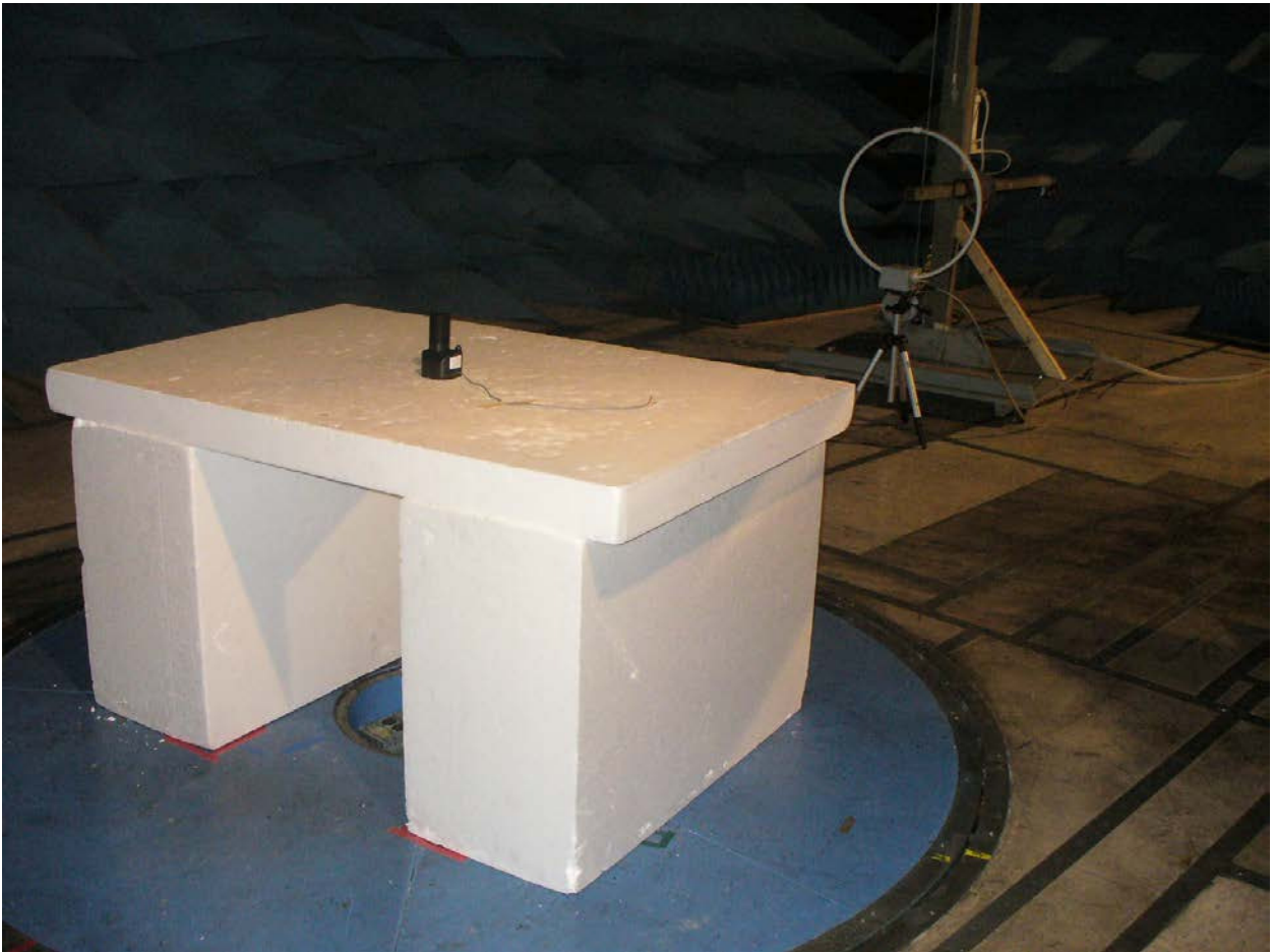
Figure 2: Radiated Emissions – Back View – 9 kHz – 30 MHz