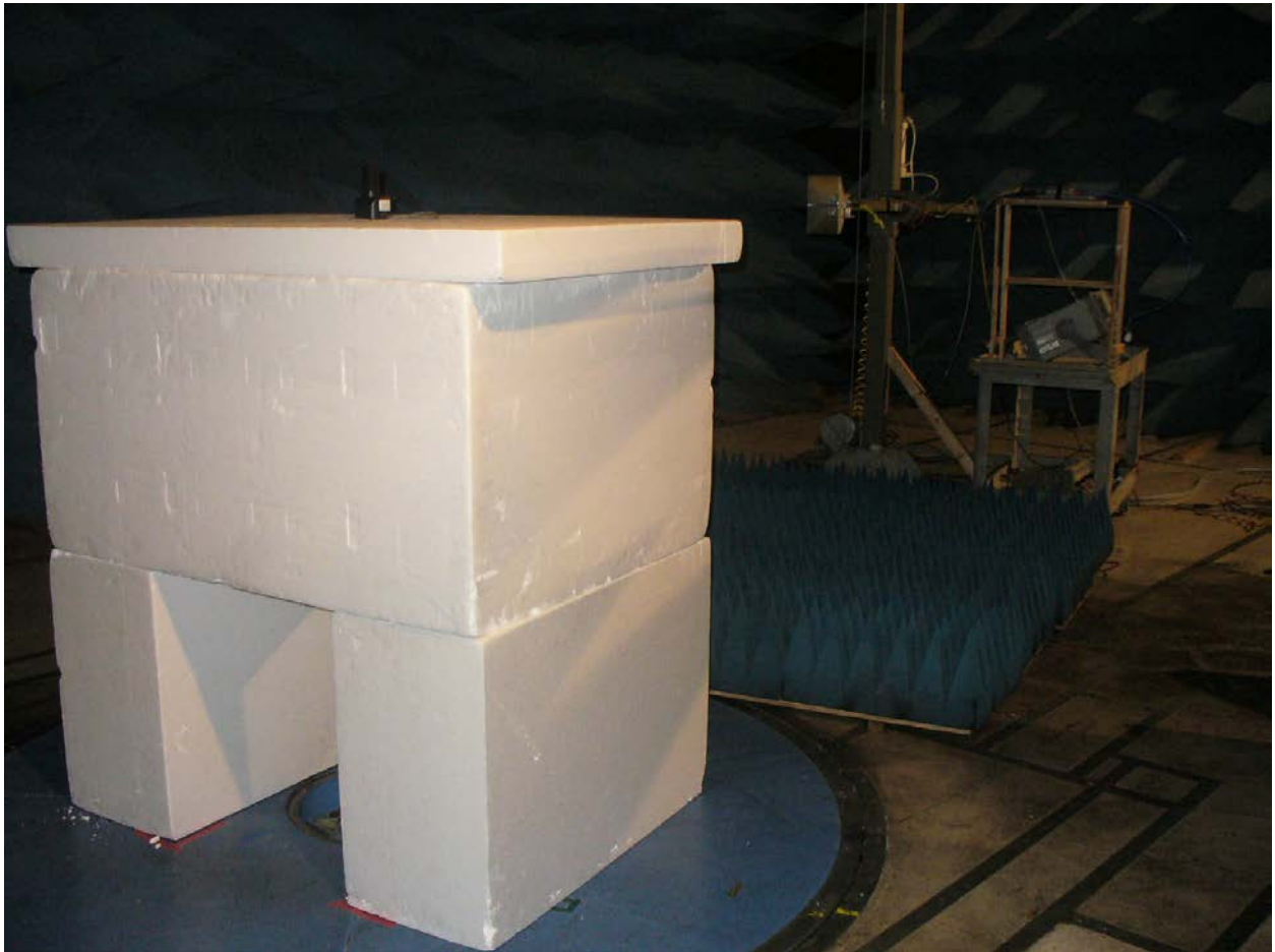
Figure 6: Radiated Emissions – Back View – Above 1 GHz