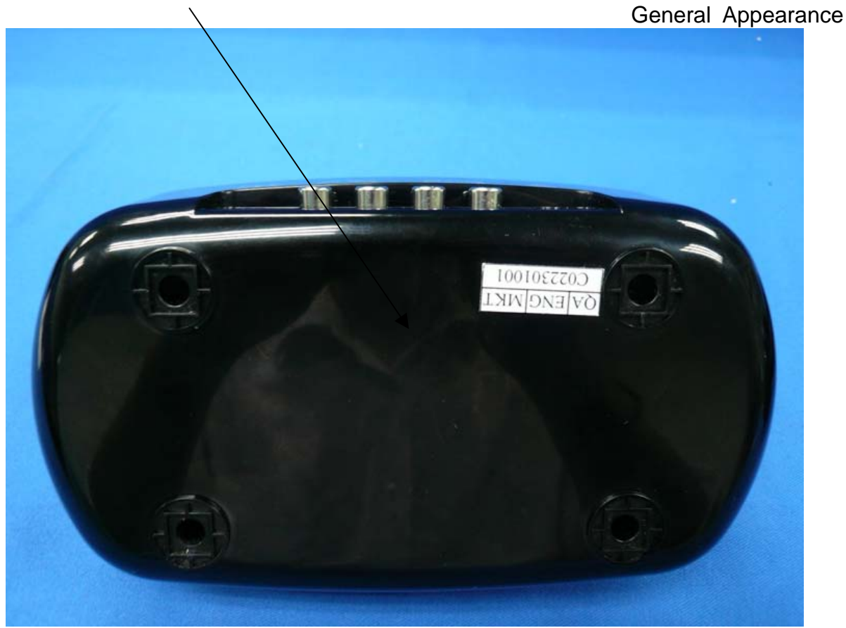
Figure 4 General Appearance