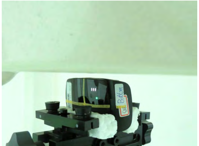
Right Side of EUT with 0.5 cm Gap