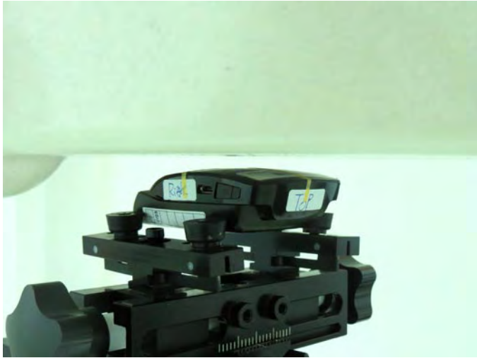
Front Face of EUT with 0.5 cm Gap