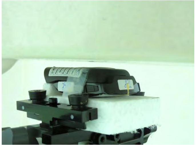
Rear Face of EUT with 0.5 cm Gap