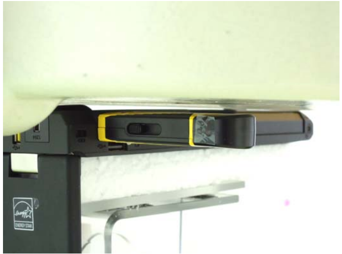
Horizontal Down with 0.5 cm Gap