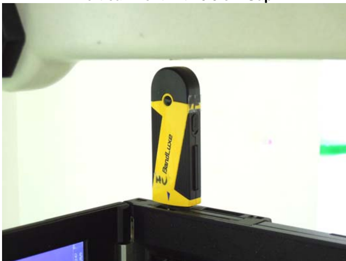
Tip Mode with 0.5 cm Gap