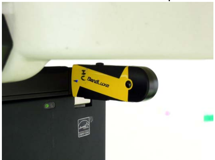
Vertical Back with 0.5 cm Gap