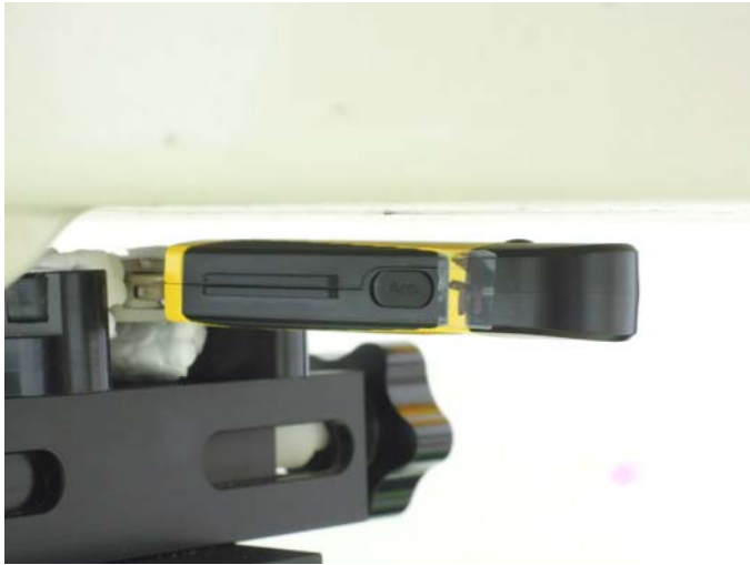
Horizontal Up with 0.5 cm Gap