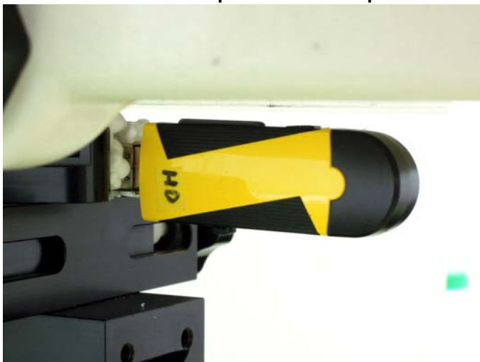
Vertical Front with 0.5 cm Gap