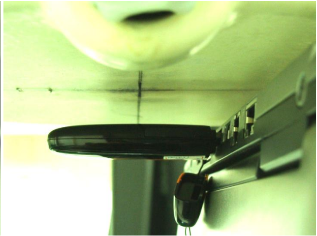
USB Configuration 1 with Laptop (Horizontal Up with Phantom 1.5 cm Gap)