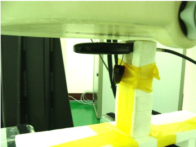
USB Configuration 2 with Cable (Horizontal Down with Phantom 1.0 cm Gap)