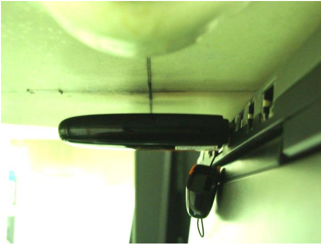
USB Configuration 1 with Laptop (Horizontal Up with Phantom 1.0 cm Gap)