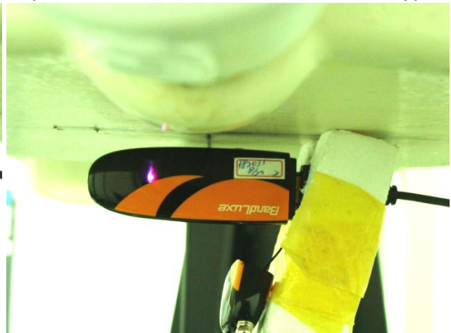
USB Configuration 4 with Cable (Vertical Back with Phantom 0.5 cm Gap)