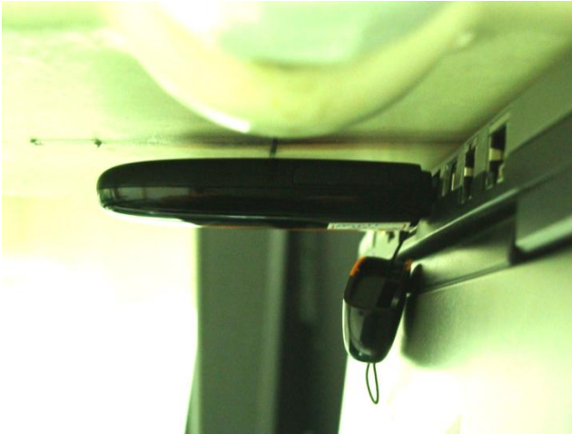
USB Configuration 1 with Laptop (Horizontal Up with Phantom 0.5 cm Gap)