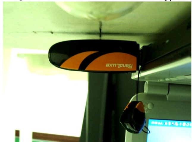
USB Configuration 4 with Laptop (Vertical Back with Phantom 0.5 cm Gap)