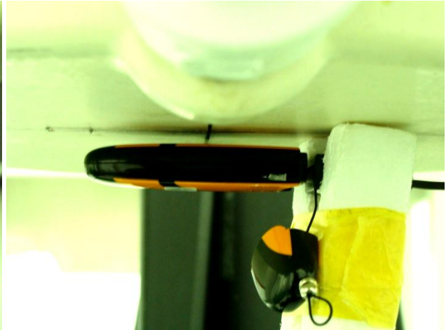
USB Configuration 2 with Cable (Horizontal Down with Phantom 0.5 cm Gap)