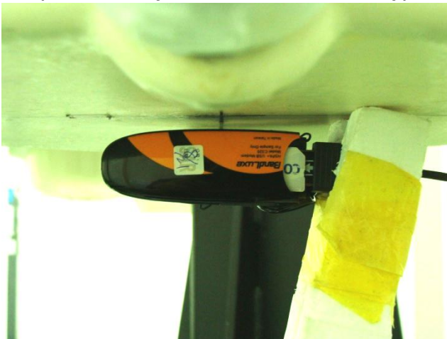
USB Configuration 3 with Cable (Vertical Front with Phantom 0.5 cm Gap)