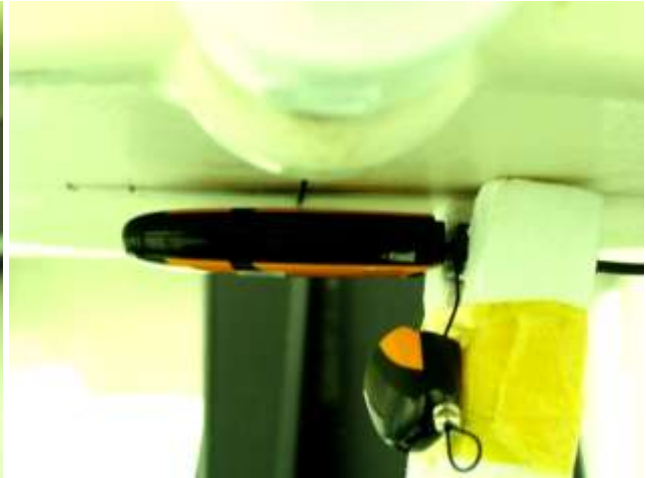
USB Configuration 2 (Horizontal Down with Phantom 0.5 cm Gap)