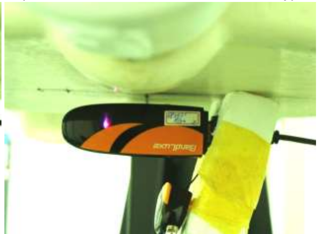
USB Configuration 4 (Vertical Back with Phantom 0.5 cm Gap)