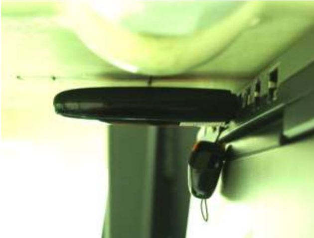
USB Configuration 1 (Horizontal Up with Phantom 0.5 cm Gap)