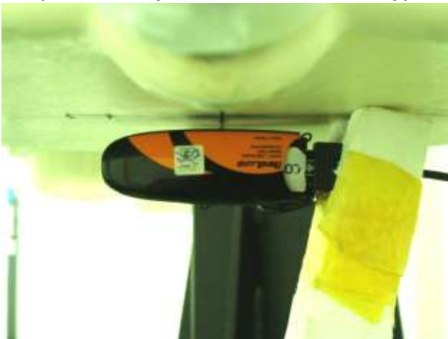
USB Configuration 3 (Vertical Front with Phantom 0.5 cm Gap)