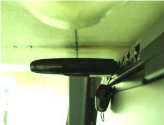
USB Configuration 1 (Horizontal Up with Phantom 1.0 cm Gap)