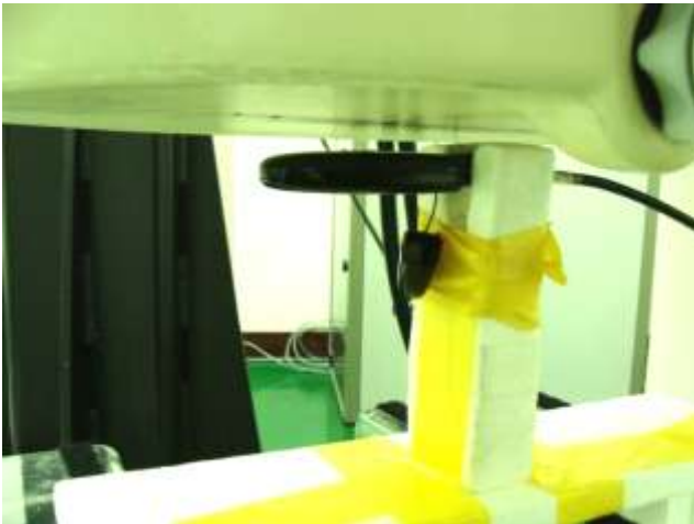
USB Configuration 2 (Horizontal Down with Phantom 1.0 cm Gap)