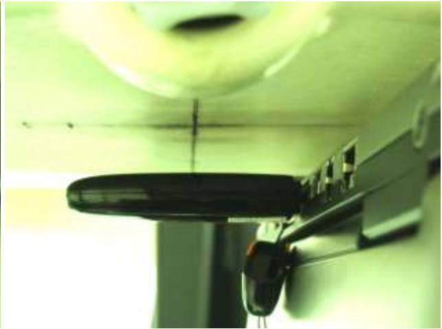
USB Configuration 1 (Horizontal Up with Phantom 1.5 cm Gap)