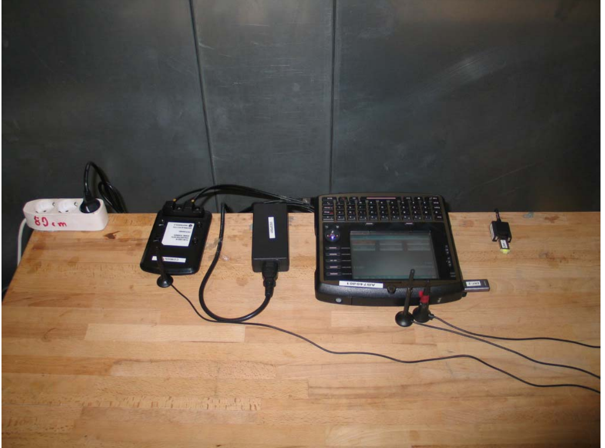
set-up for conducted tests