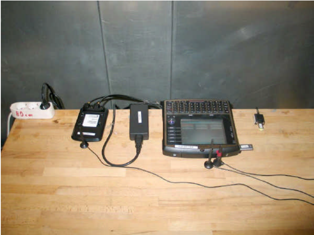
Photo 4: Test setup for conducted measurements (AC Port (power line))