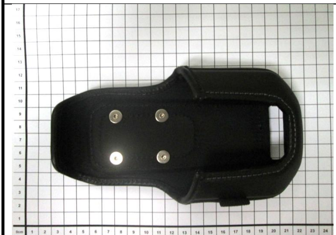
Holster – Front View