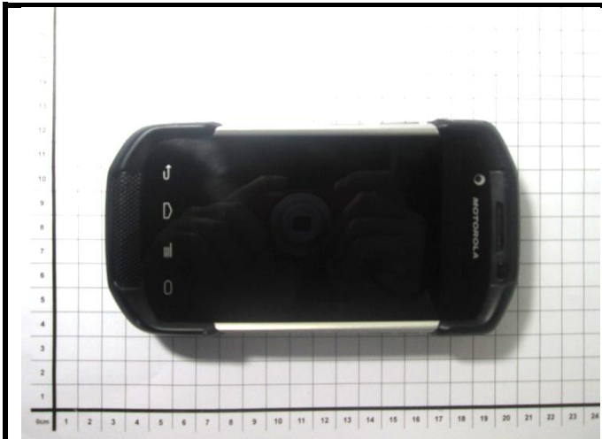
EUT – Front View