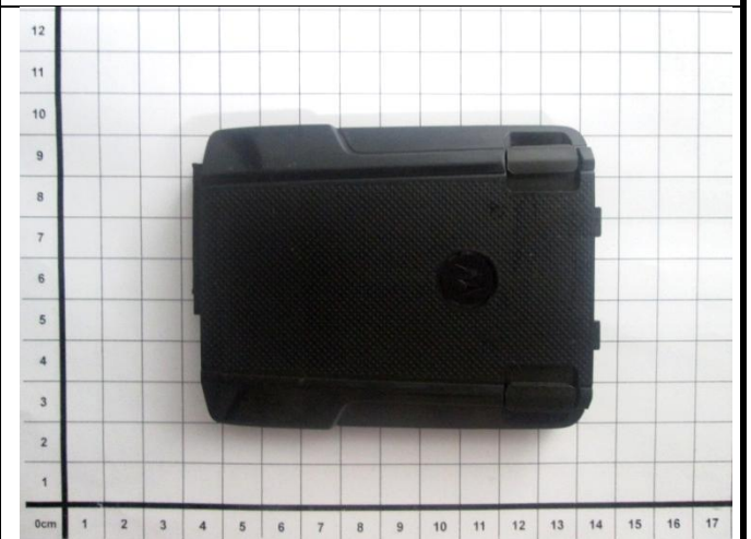
Battery – Rear View