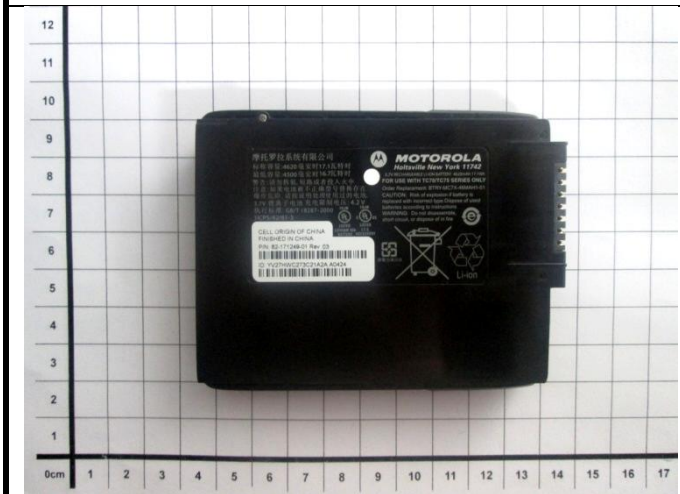
Battery – Front View