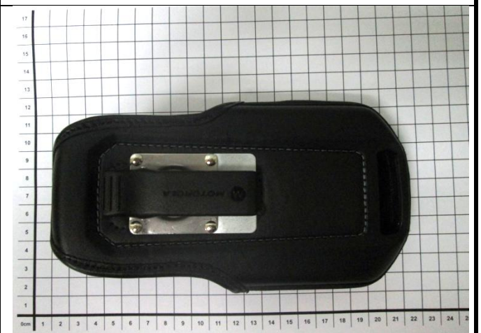
Holster – Rear View