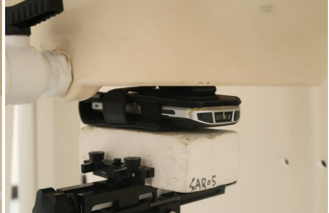
Front + Soft holster, Test Separation 0mm