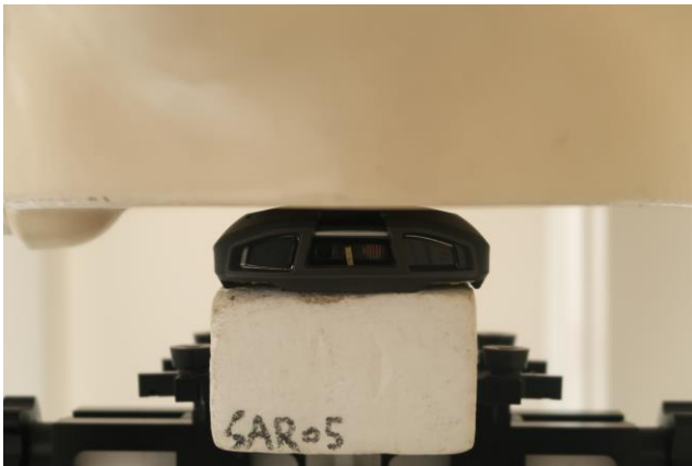
Back + Exoskeleton + Trigger Handle1, Test Separation 0mm