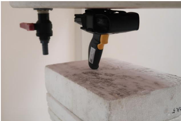
Front +Soft holster + Exoskeleton + Trigger Handle1, Test Separation 0mm