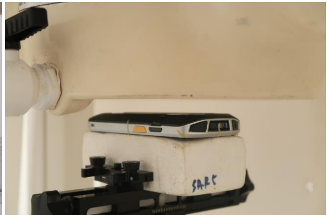
Back side, Test Separation 15mm