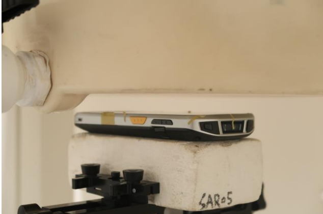
Front, Test Separation 15mm