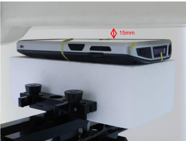
Front, Test Separation 15 mm