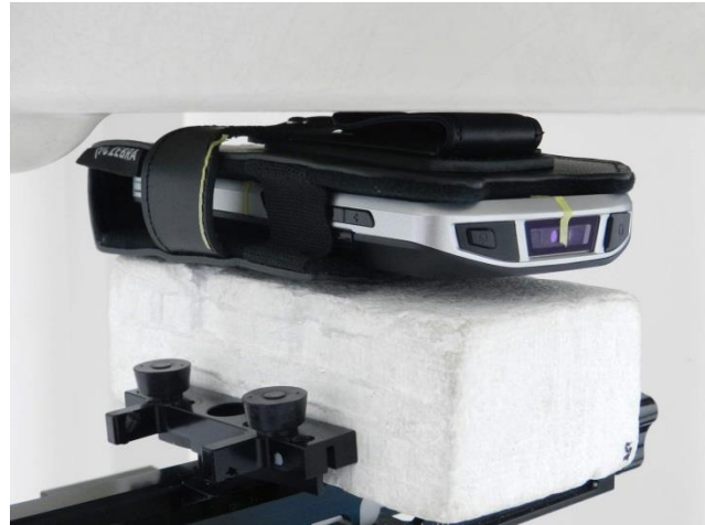
Front with Soft Holster, Test Separation 0 mm