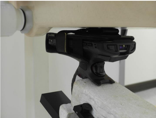
Front with Soft Holster+Exoskeleton+Trigger Handle, Test Separation 0 mm