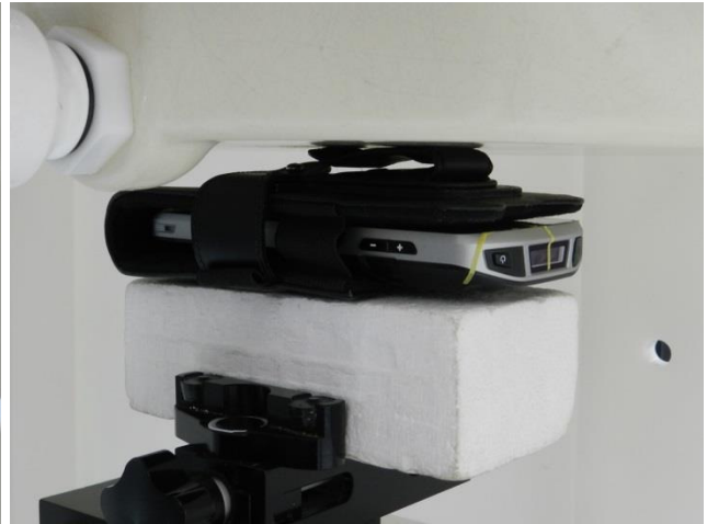
Front with Soft Holster, Test Separation 0 mm