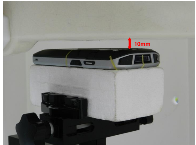
Back, Test Separation 10 mm