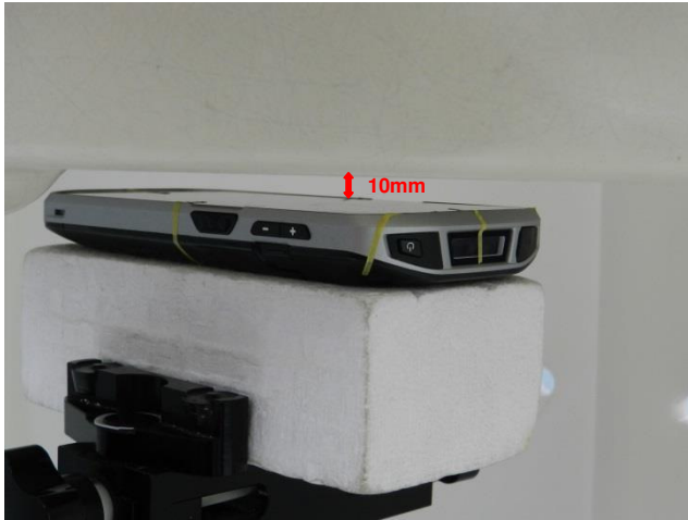
Front, Test Separation 10 mm