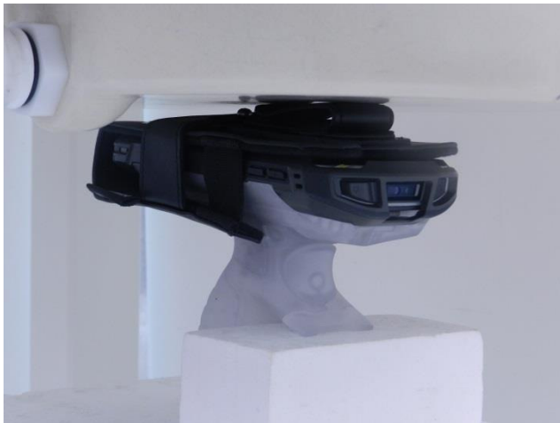
Front with Soft Holster+ Exoskeleton +Trigger Handle, Test Separation 0 mm