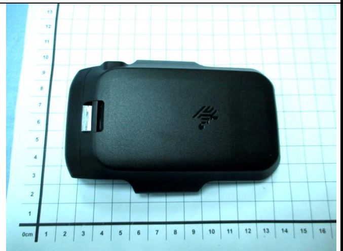
Power Back –Rear View