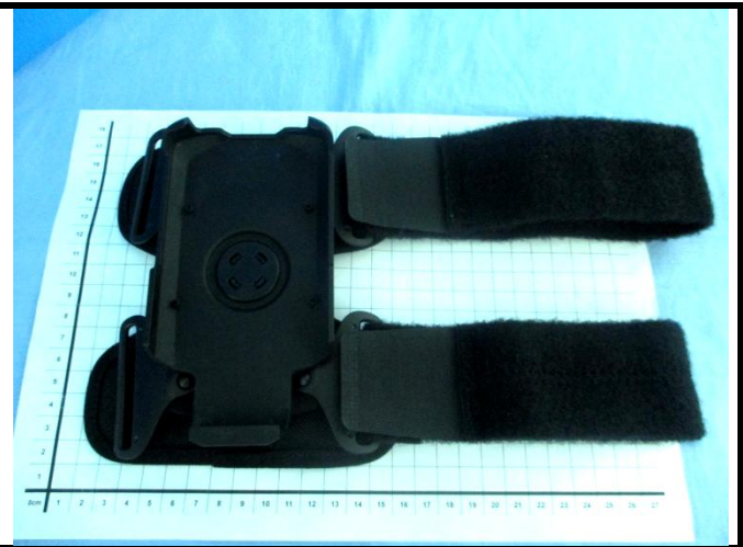
Arm – Rear View