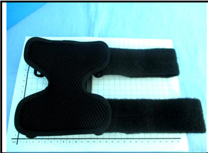
Arm – Front View