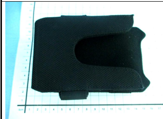
Holster – Front View