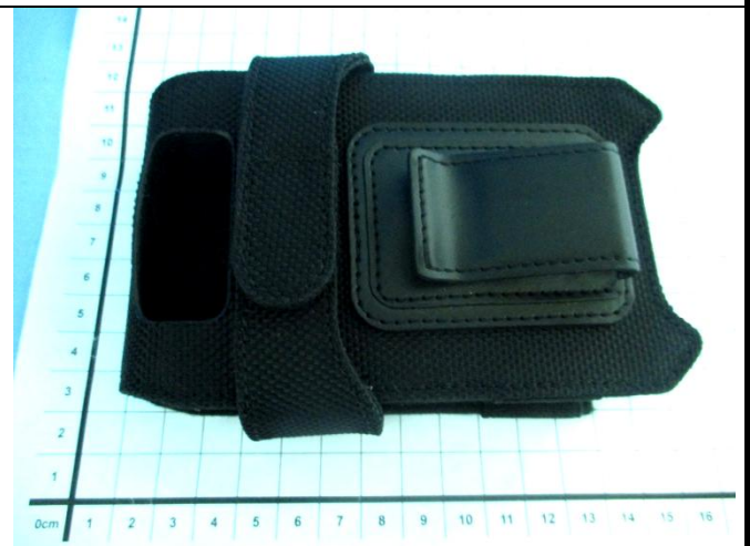
Holster – Rear View