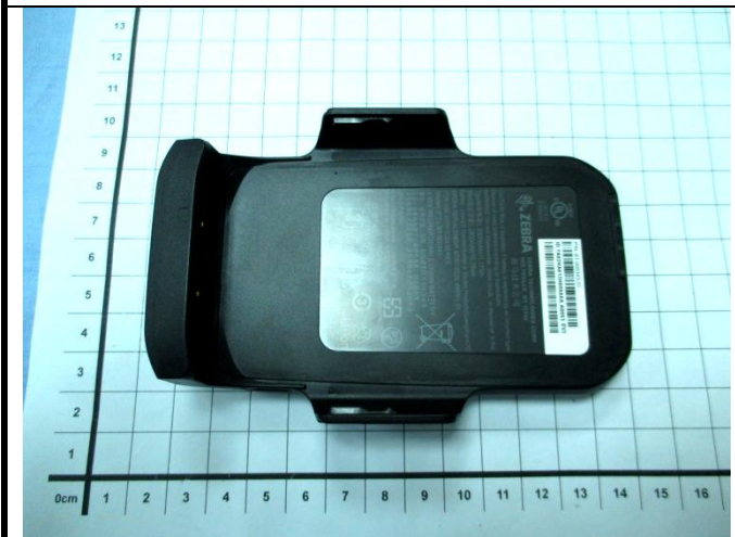
Power Back – Front View