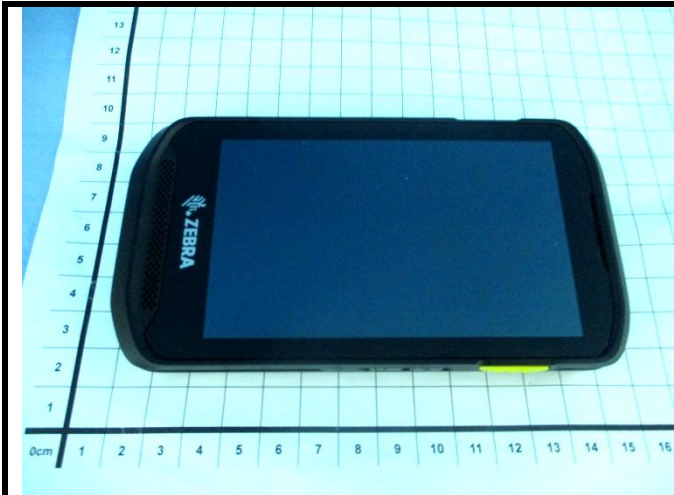
EUT – Front View