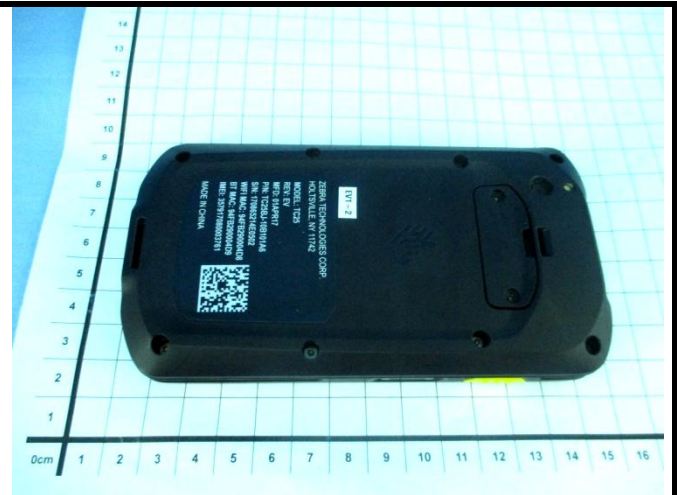
EUT – Rear View