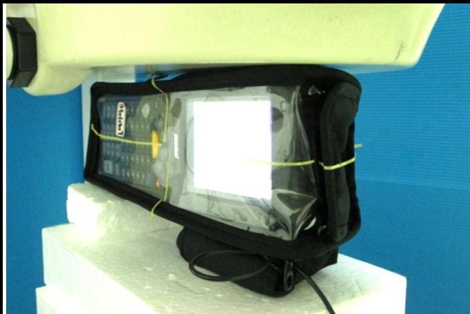
Left Side of EUT with 0 cm Gap (w/ Headset + Holster 1)