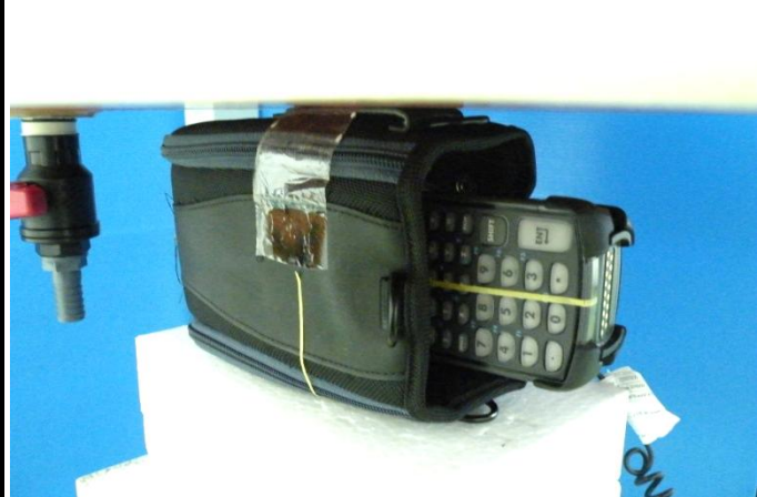
Right Side of EUT with 0 cm Gap (w/ Headset + Holster 2)