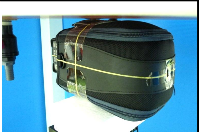
Left Side of EUT with 0 cm Gap (w/ Headset + Holster 2)