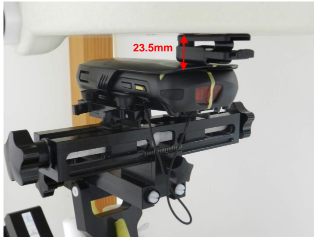
Front with rigid holster 1 (holster 1)