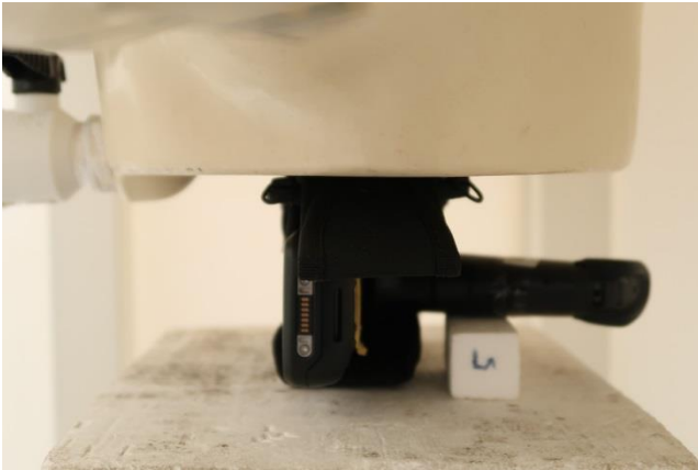
Right Side, Gun + Battery 1 + KeyPad + Holster 3, Test Separation 0mm