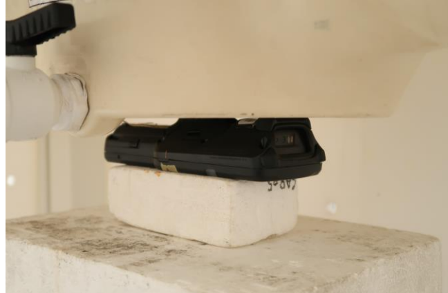
Back, Cut Gun + Battery 2/3/4/5 + KeyPad, Test Separation 0mm