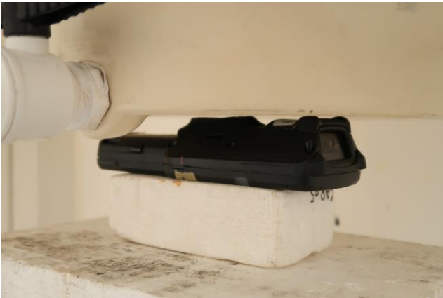
Back, Cut Gun + Battery 1 + KeyPad 38/47/29, Test Separation 0mm