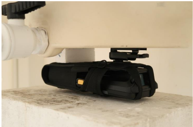
Back, Brick + Battery 2/3/4/5 + KeyPad + Holster 1, Test Separation 0mm