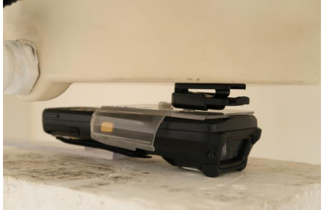
Front, Brick + Battery 1 + KeyPad + Holster 2, Test Separation 0mm