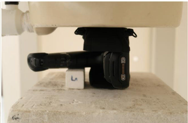
Left Side, Gun + Battery 2/3/4/5 + KeyPad + Holster 3, Test Separation 0mm