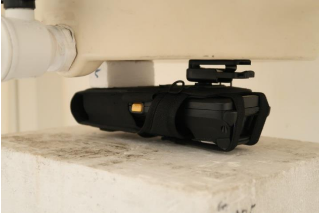
Front, Brick + Battery 1+ KeyPad + Holster 1, Test Separation 0mm