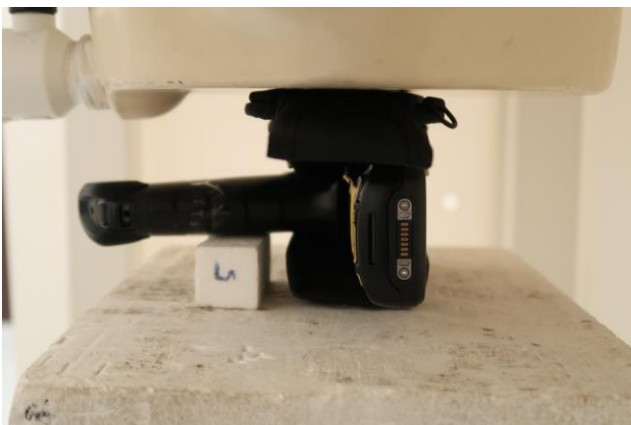
Left Side, Gun + Battery 1 + KeyPad + Holster 3, Test Separation 0mm