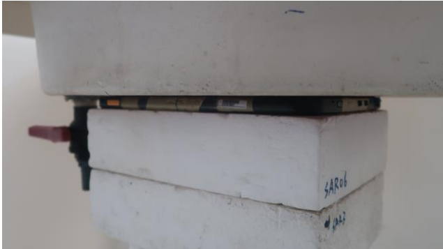
Bottom Face at 0 mm