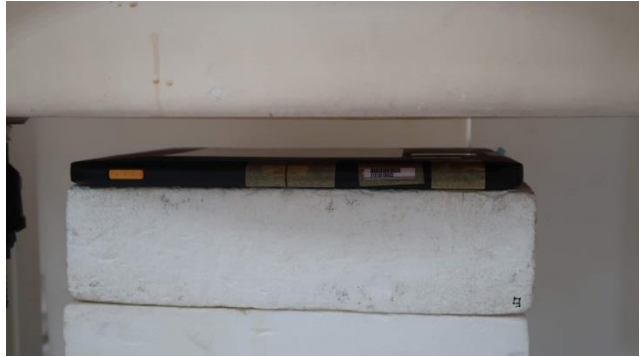
Bottom Face at 29 mm