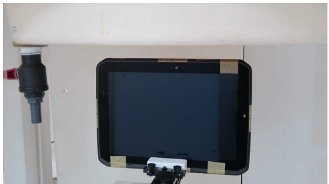
Edge1 at 27 mm