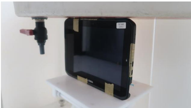
Edge1 at 0 mm