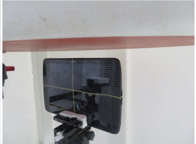
Edge4, Test Separation 15 mm(Sensor off)