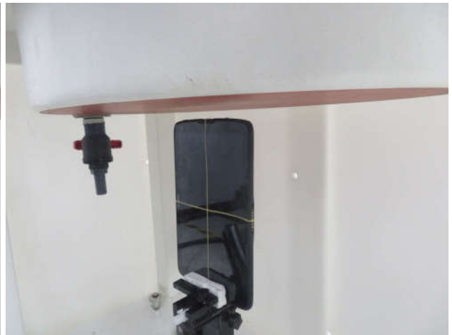
Edge1, Test Separation 17 mm(Sensor off)