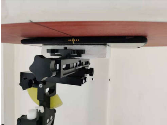
Bottom Face, Test Separation 0 mm