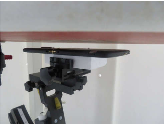
Bottom Face, Test Separation 17 mm(Sensor off)