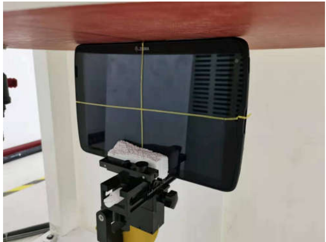
Edge4, Test Separation 0 mm