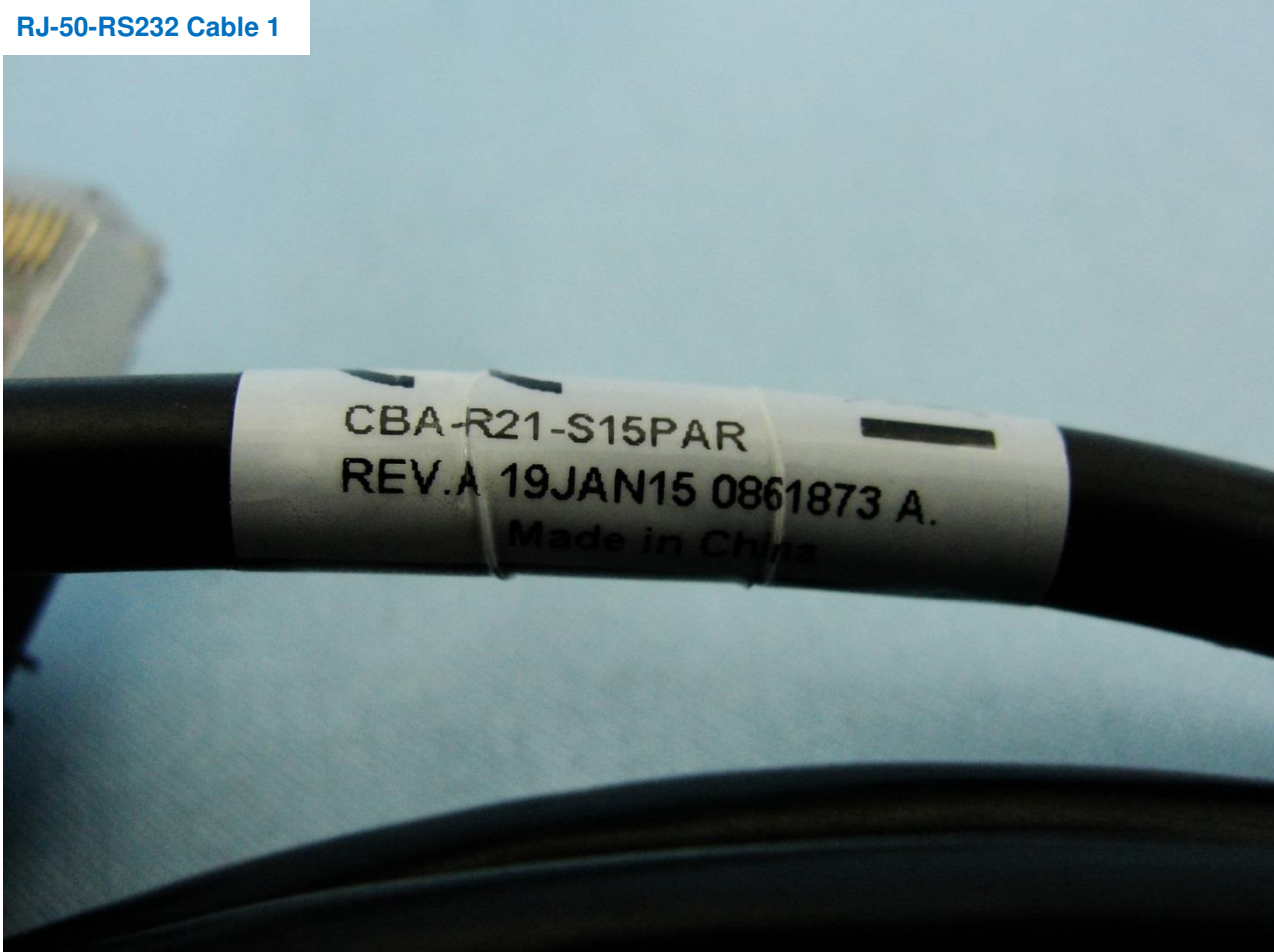
RJ-50-RS232 Cable 1

Brand Name: Zebra / Model Name: CR8178-SC