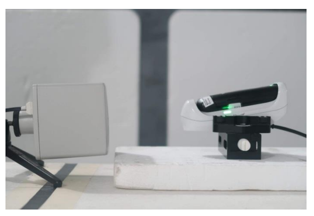
The Electric Field Probe is placed 10cm distance to the front surface of EUT

TEL: 886-3-327-3456 Page A1 of A1 FAX: 886-3-328-4978 Issued Date Aug. 17, 2020