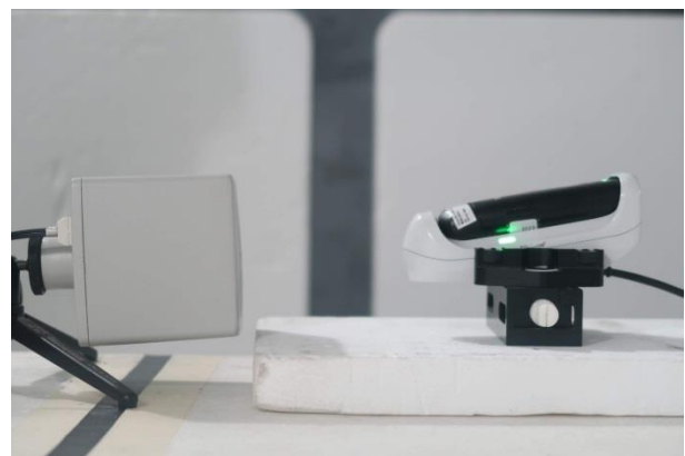
The Electric Field Probe is placed 10cm distance to the front surface of EUT