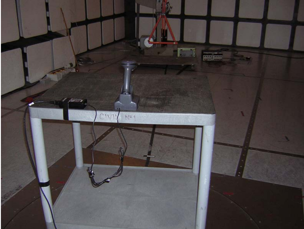
Config 1 – Stand Alone Radiated Emissions (Enclosure Port)