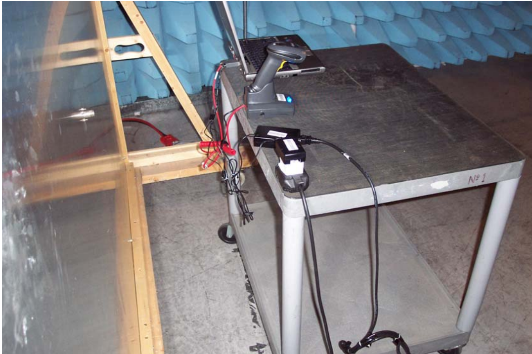
Config 2 – RS232 Conducted Emissions (AC Power Port)