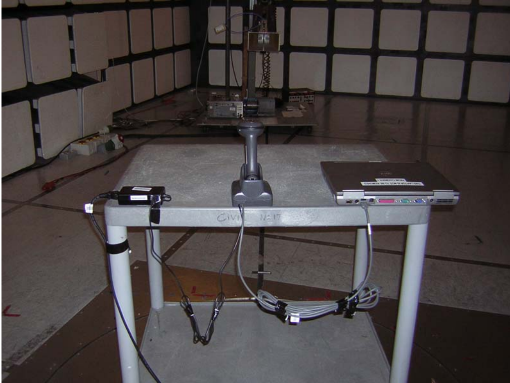
Config 3 – USB Radiated Emissions (Enclosure)