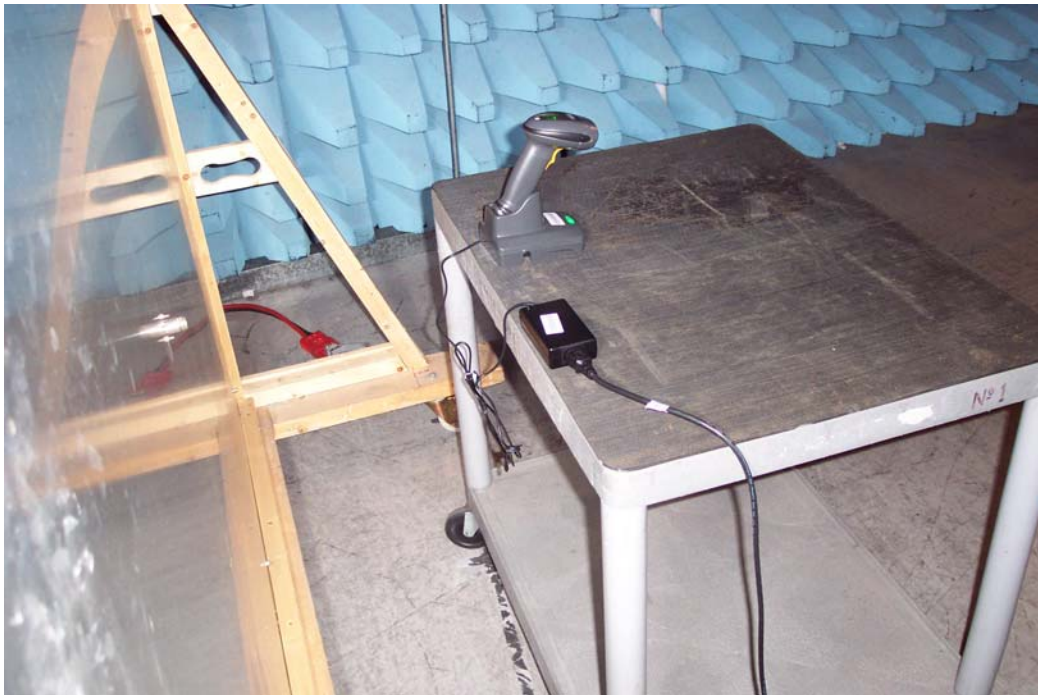
Config 1 – Stand Alone Conducted Emissions (AC Power Port)