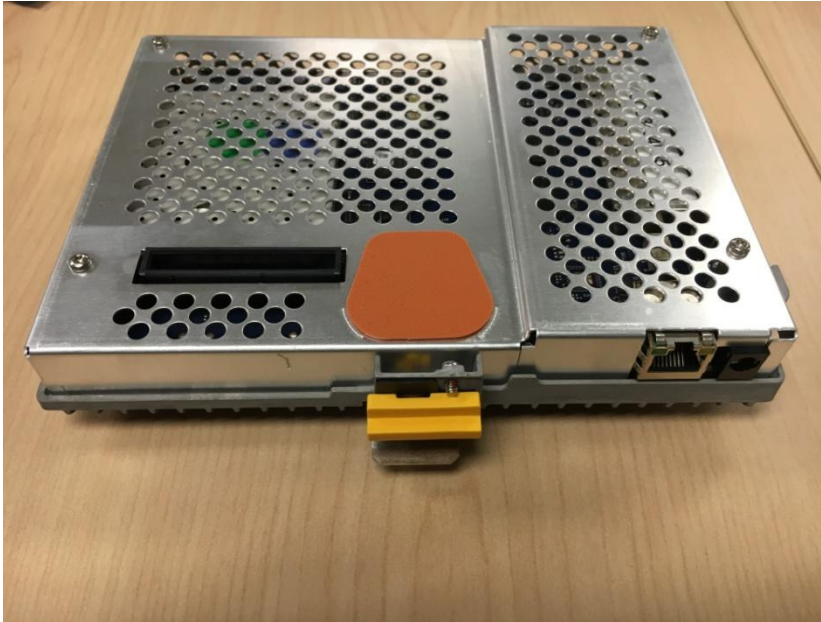
21-199765-01 (FX-7508 with outer shield)

The modular transmitter must have its own RF shielding