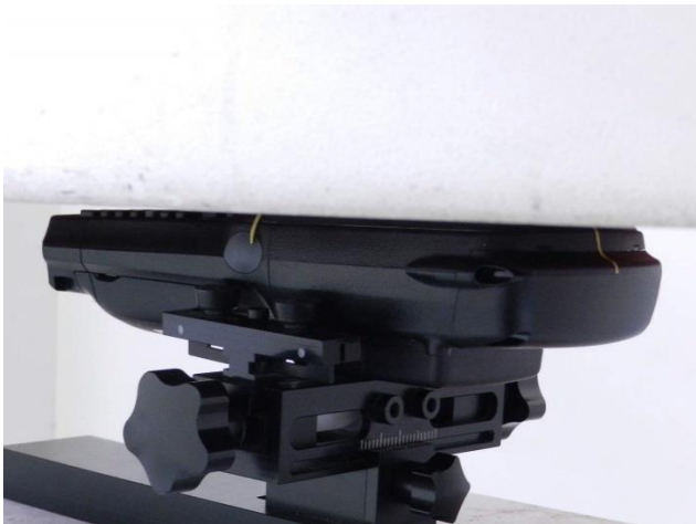
Host 1, Front, Test Separation 0 cm