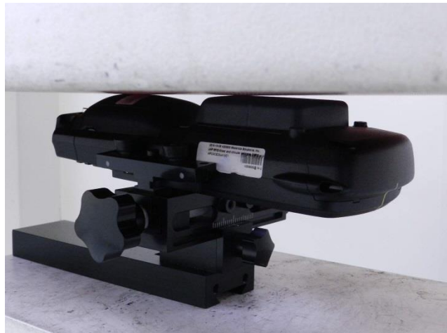
Host 1 and 2, Back, Test Separation 0 cm