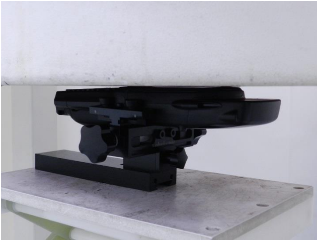
Host 3, Front, Test Separation 0 cm