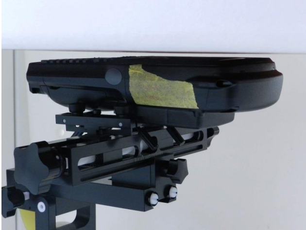
Host 1, Front, Test Separation 0.3 cm