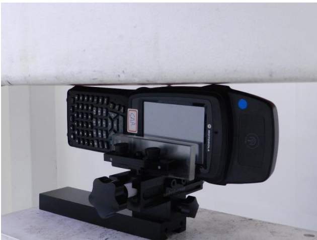
Host 3, Left Side, Test Separation 0 cm