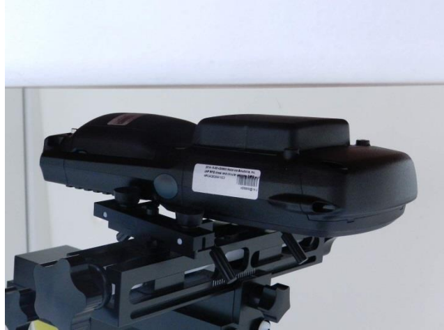
Host 1, Back, Test Separation 1.5 cm