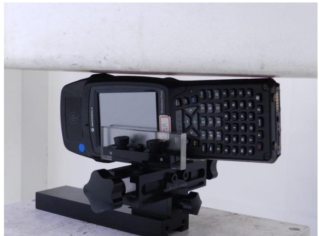
Host 3, Right Side, Test Separation 0 cm