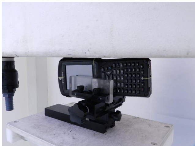
Host 1, Right Side, Test Separation 0 cm