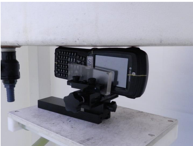
Host 1, Left Side, Test Separation 0 cm