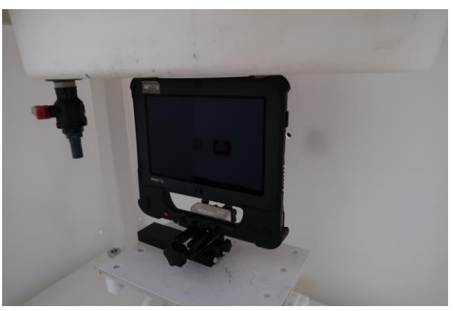
Edge3 with Xpad at 0 mm