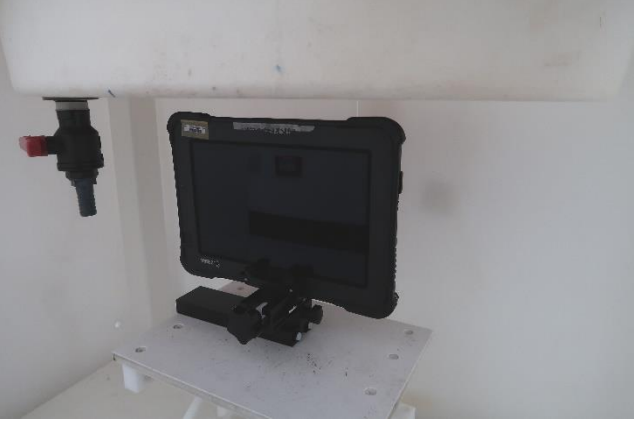
Edge3 with Xslate at 16 mm

TEL: 886-3-327-3456 Page: D1 of D1 FAX: 886-3-328-4978 Issued Date: Jun. 14, 2022