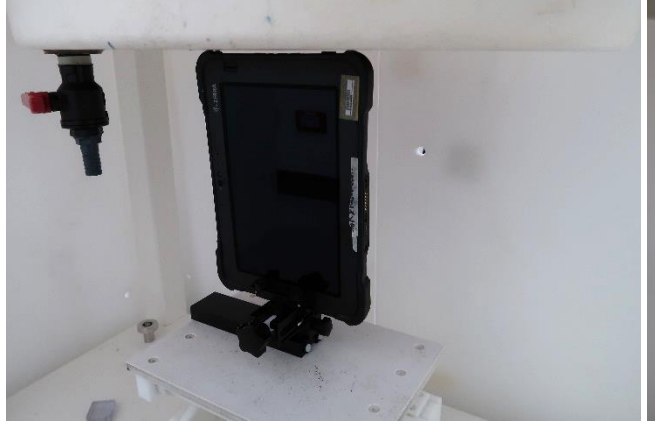
Edge2 with Xslate at 0 mm