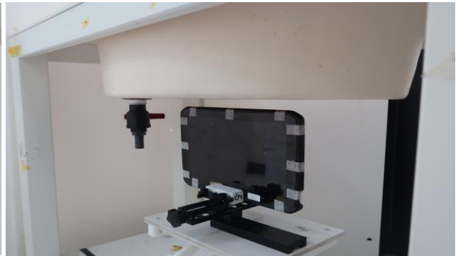
Edge1 at 22 mm