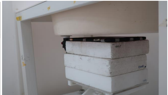
Bottom Face at 15 mm