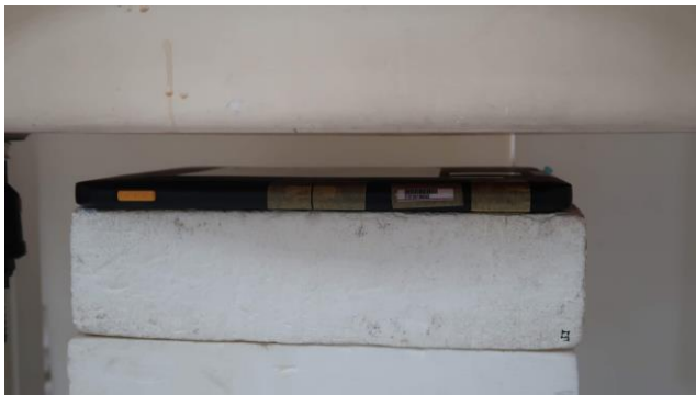
Bottom Face at 29 mm