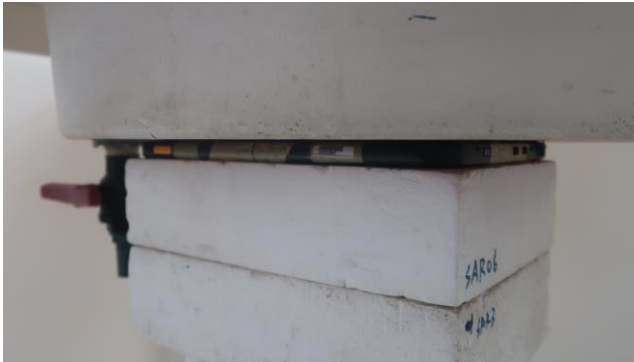
Bottom Face at 0 mm