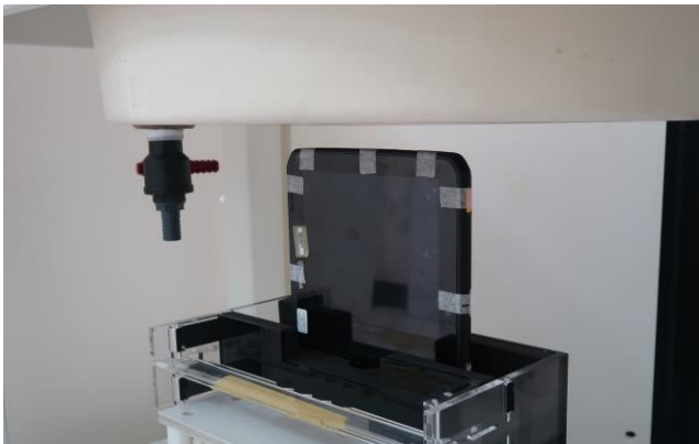
Edge4 at 24 mm