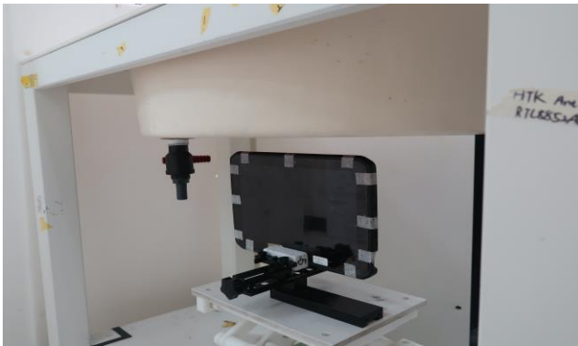
Edge1 at 31 mm