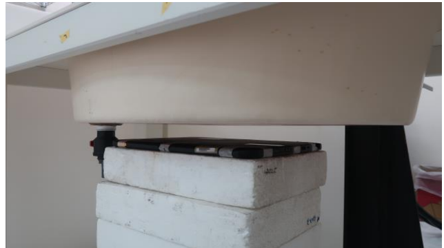
Bottom Face at 37 mm