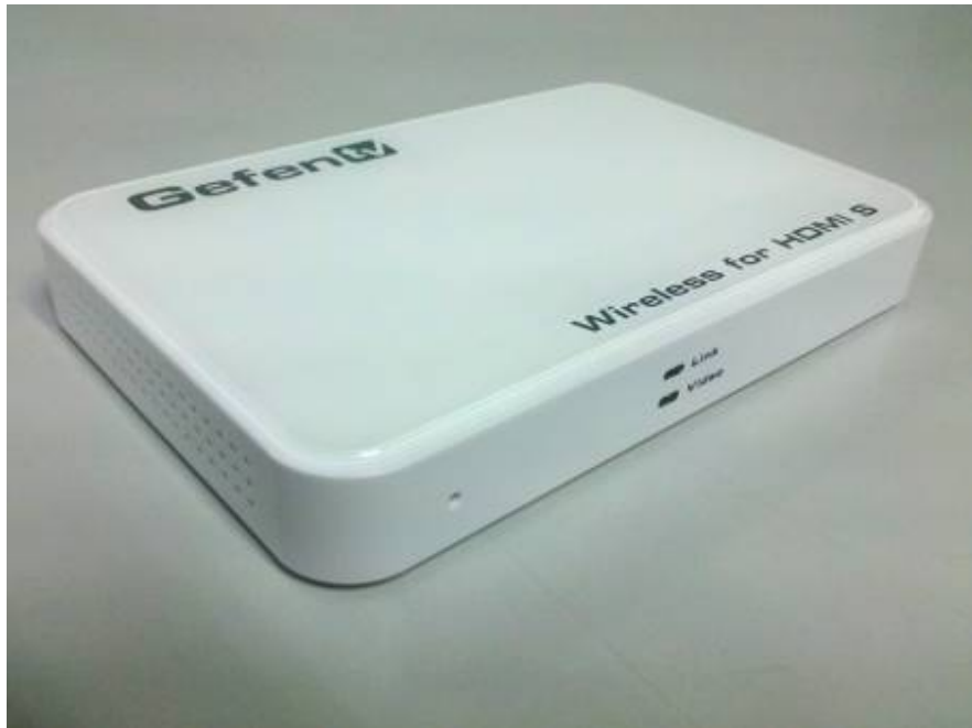
EUT—Right Side View