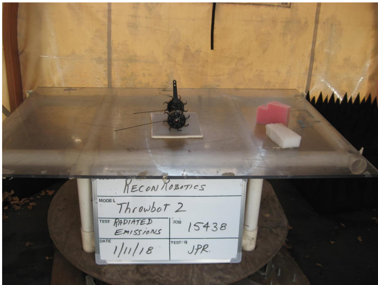
RE Tail Up