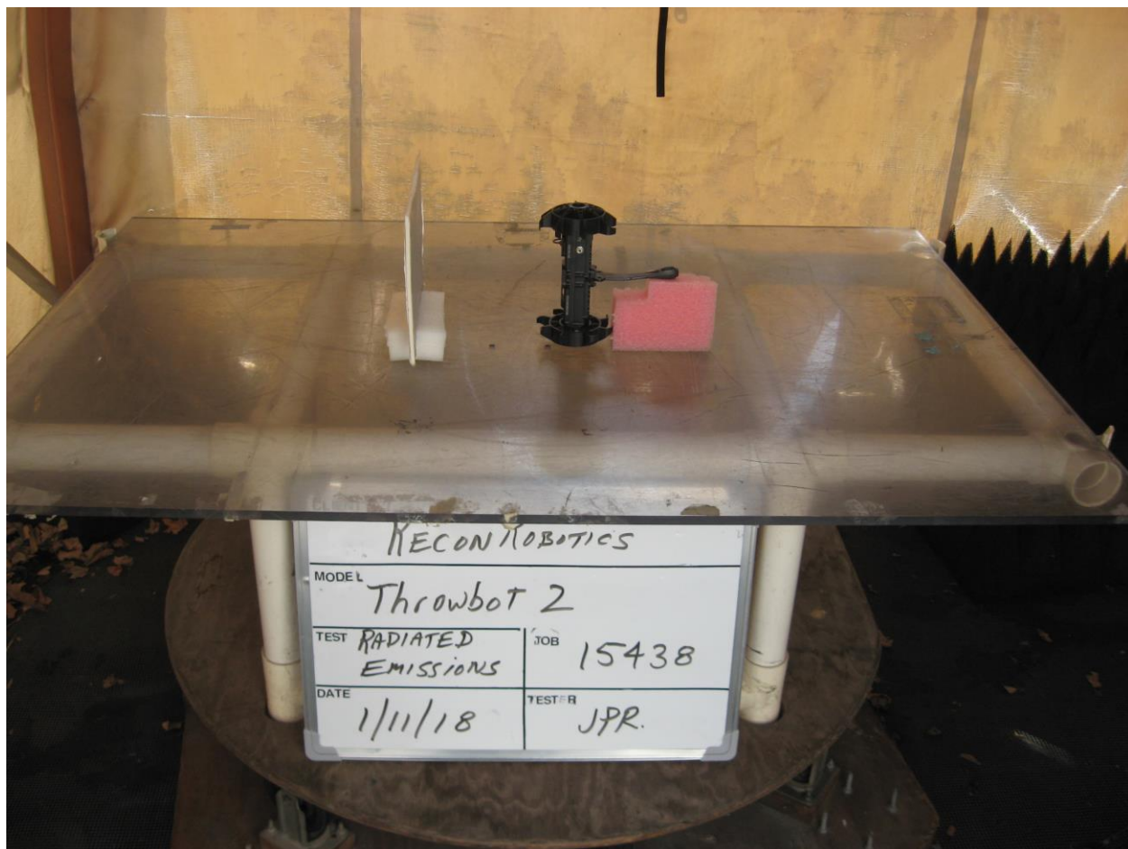
RE Wheels Up.