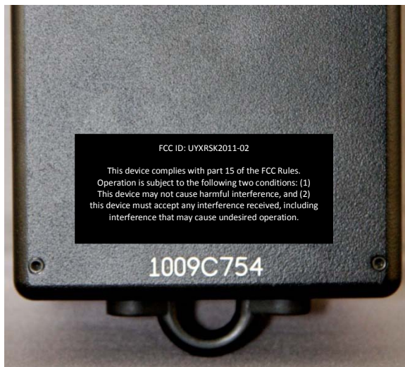
Figure 1: Proposed label location