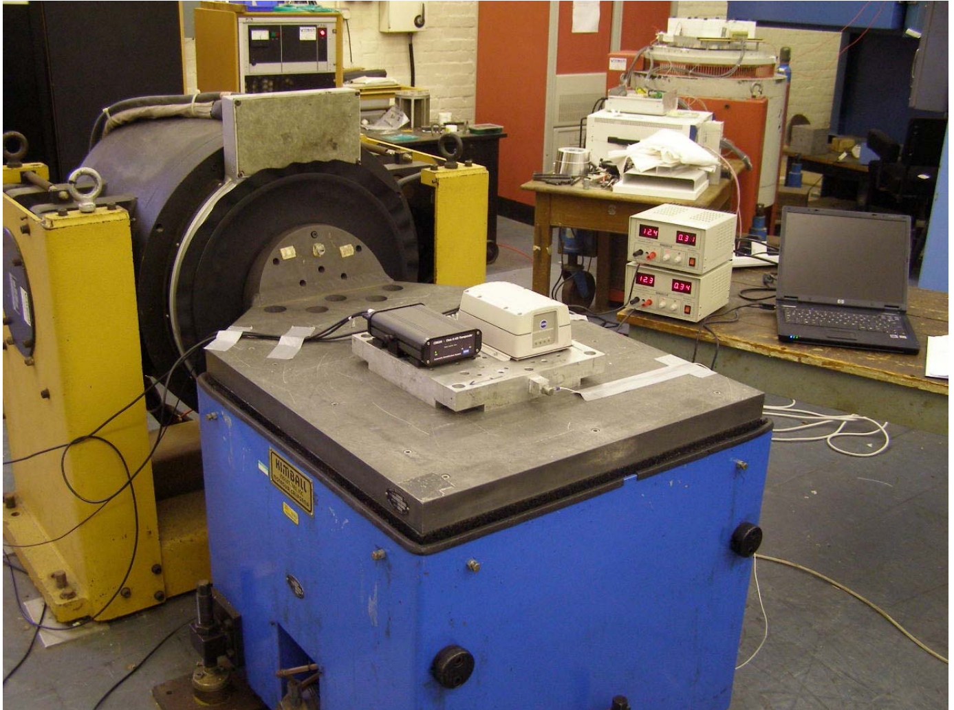
Figure 3. General View of Test Setup for Longitudinal Vibration Tests Performed on the Kimball Slip Table Driven By the LDS V825L Shaker.

CERTIFICATE No: WA/TF/0689 SHEET No. 8 of 9