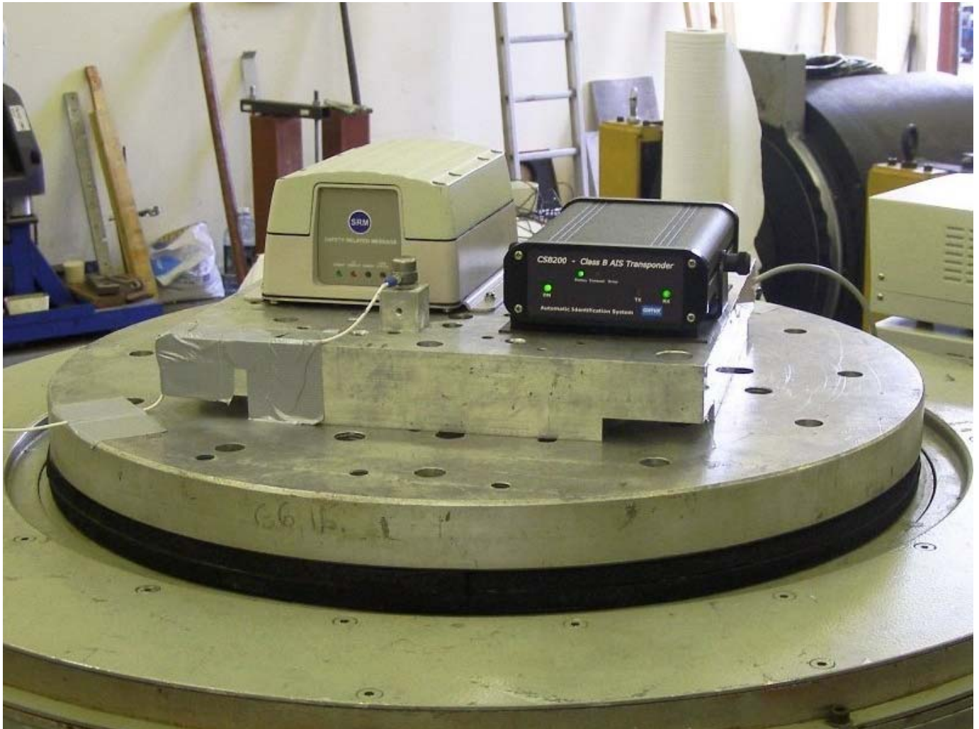
Figure 1. General View of Test Setup for Vertical Vibration Tests Performed on the Derritron DV5 Shaker.

CERTIFICATE No: WA/TF/0689 SHEET No. 6 of 9