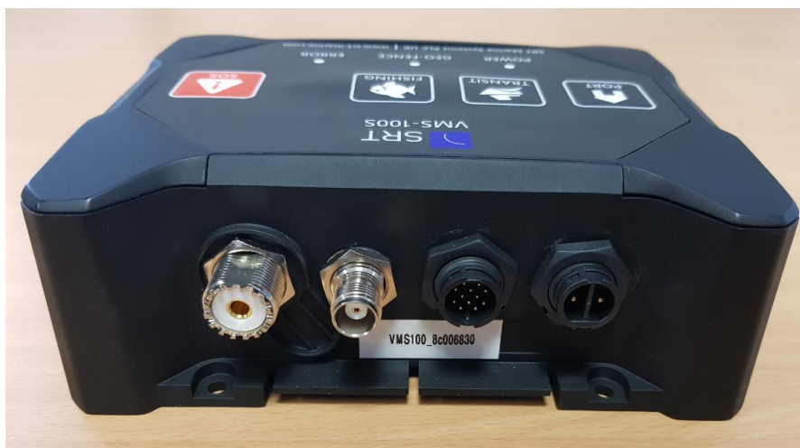
5. Connectors 2