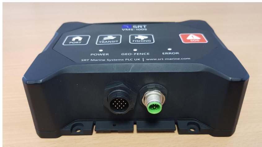
4. Connectors 1