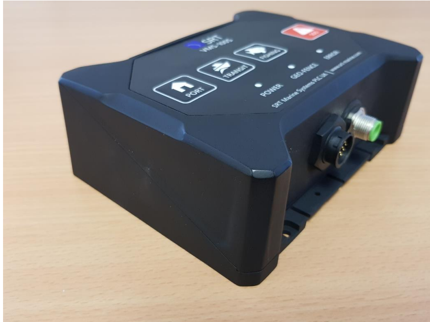
3. Side 2