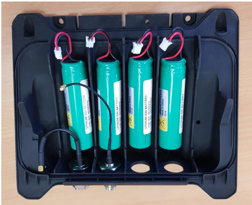
9. Battery Compartment