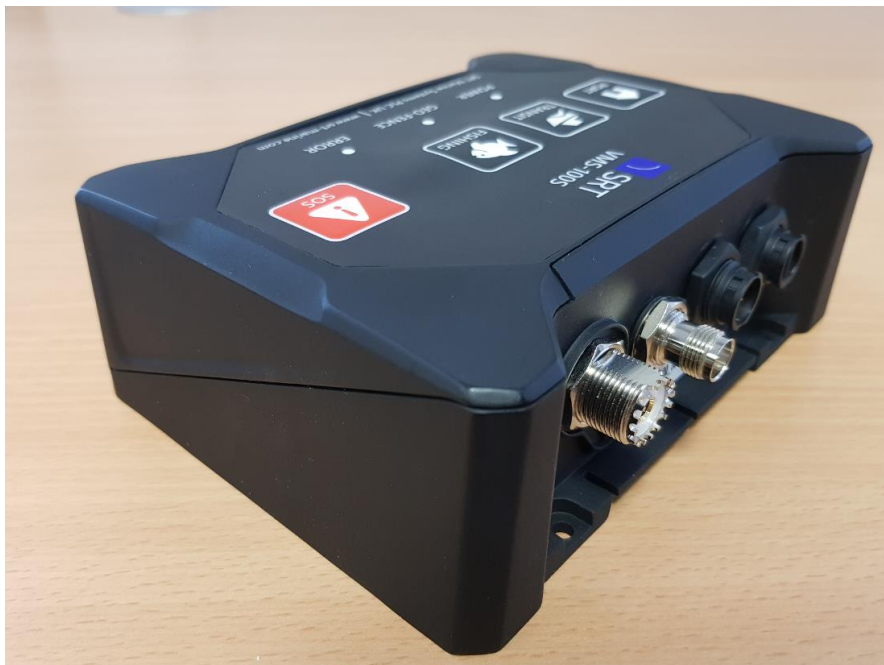
2. Side 1