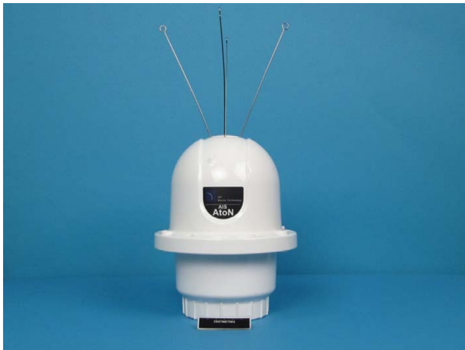
Equipment Under Test

The Equipment Under Test (EUT) was a SRT Marine Technology Ltd Carbon TRS-418-0003/TR-418-0001 as shown in the photograph below. A full technical description can be found in the manufacturer's documentation.