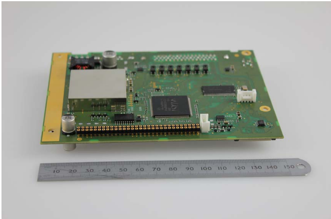
Figure 5 – Baseband PCB Bottom