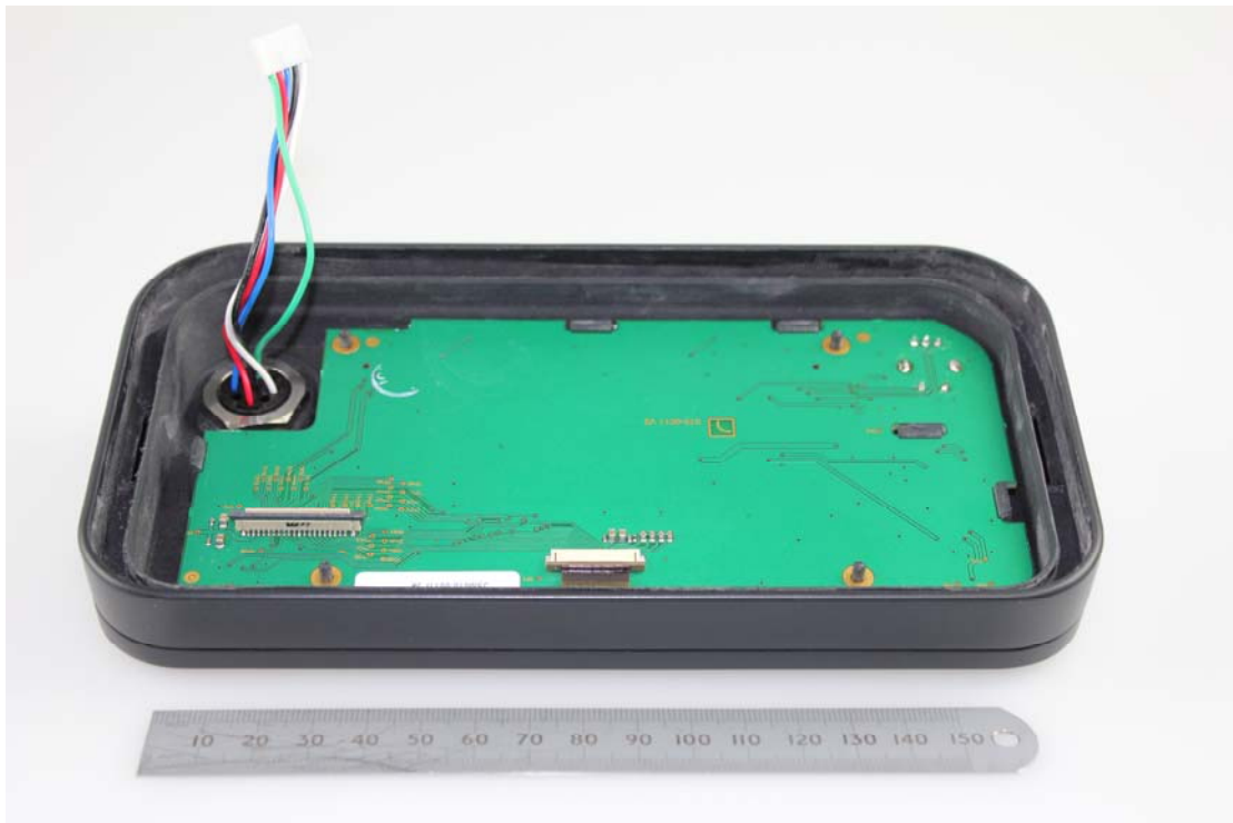
Figure 9 – Display Rear