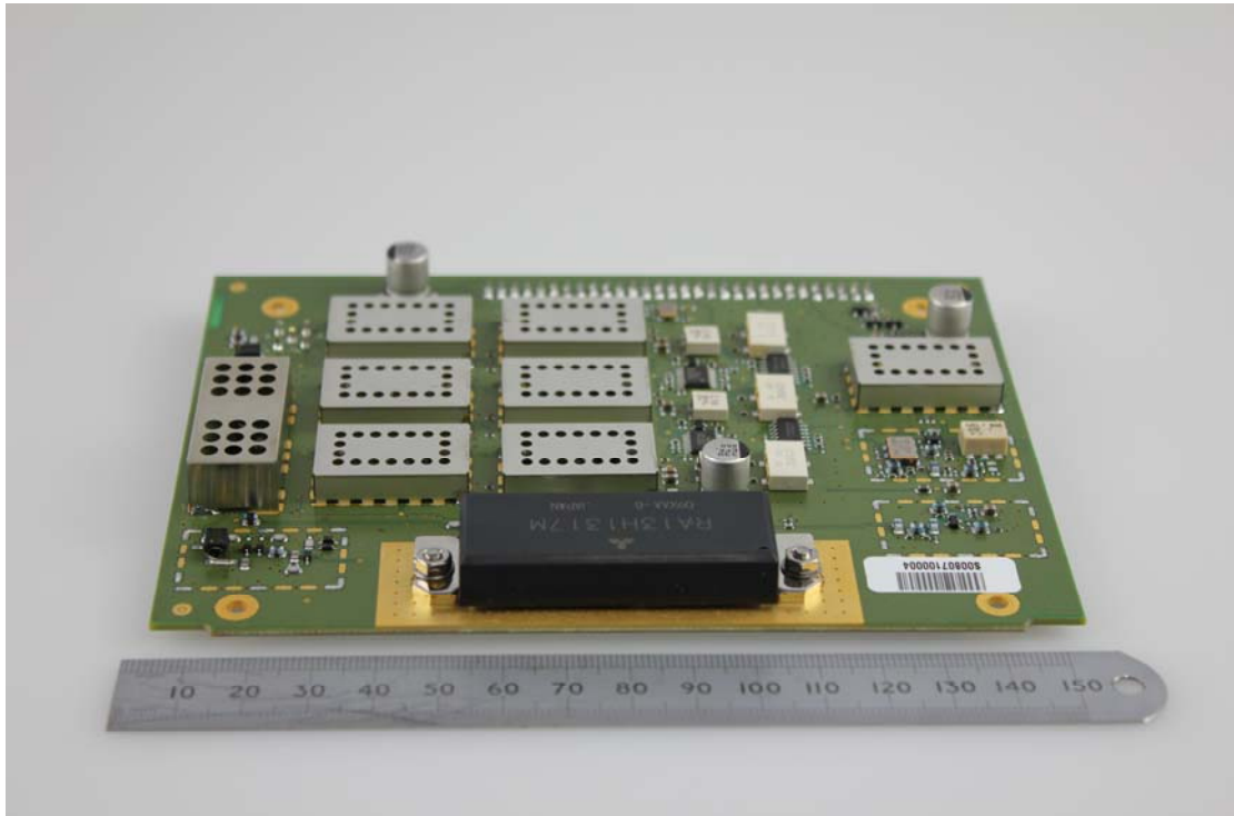
Figure 8 – RF PCB Top