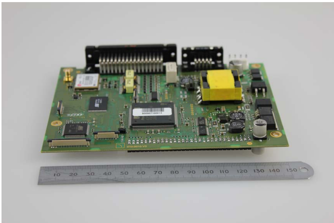
Figure 6 – Baseband PCB Top