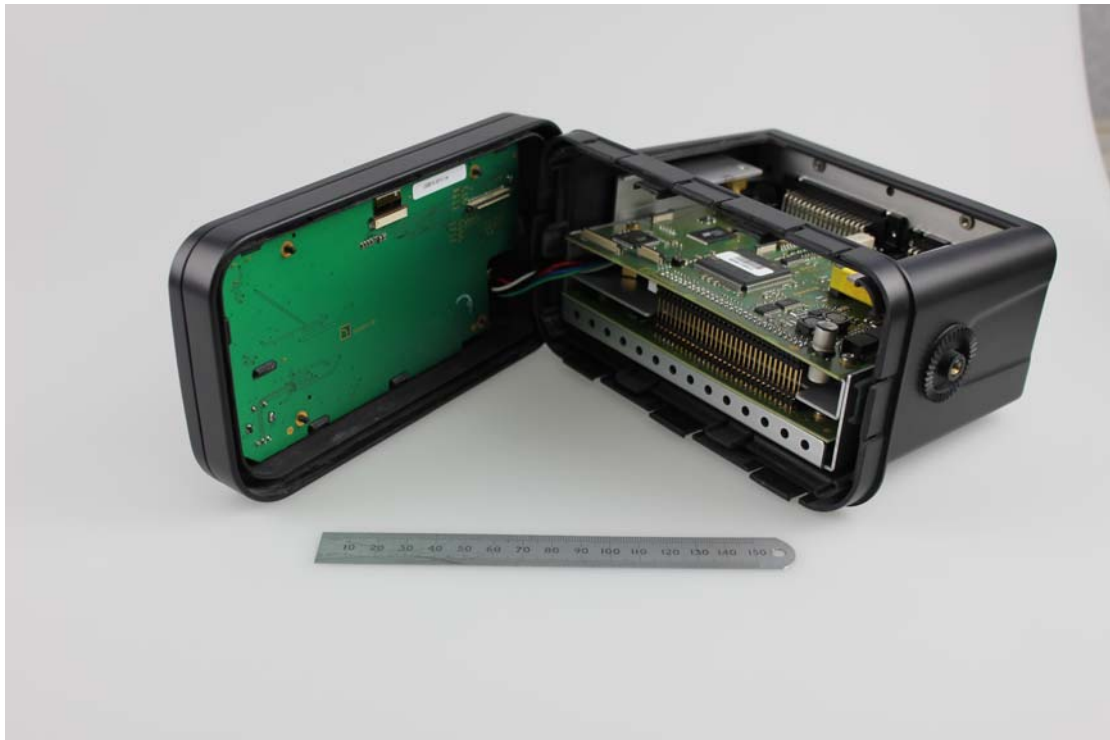
Figure 1 - PCB's & EMC shield placed inside of casing