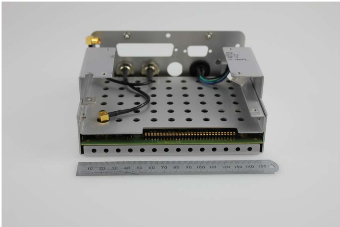
Figure 3 – RF PCB inside of EMC shield Pt2