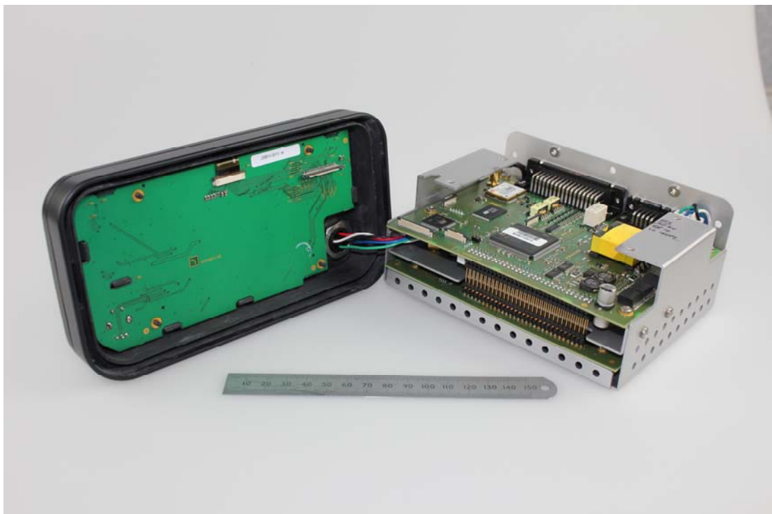
Figure 2 – PCB's Inside of EMC shield