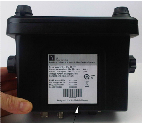
LABEL TO BE PLACED IN RECESS ON UNDERSIDE OF UNIT